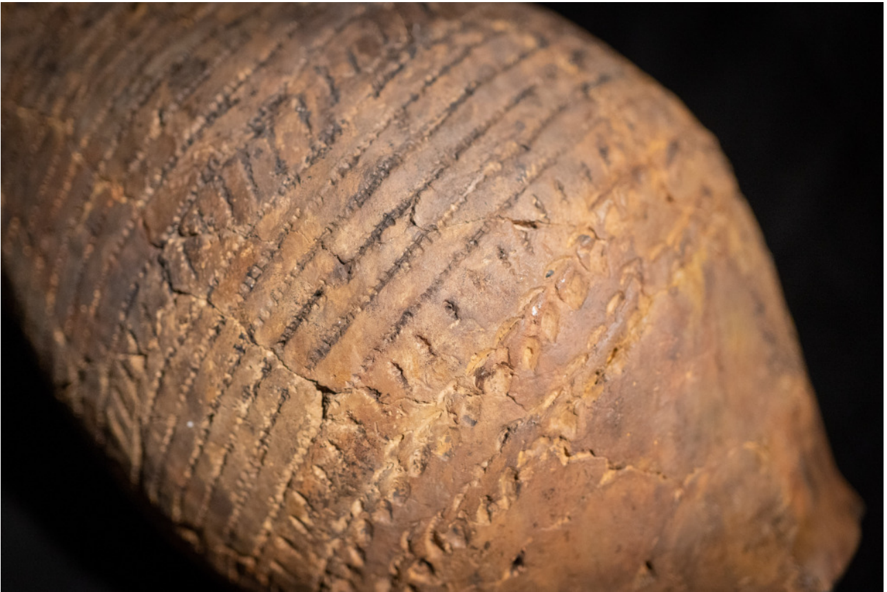
Historische Stücke der Stadtgeschichte sind im Stadtmuseum ausgestellt.