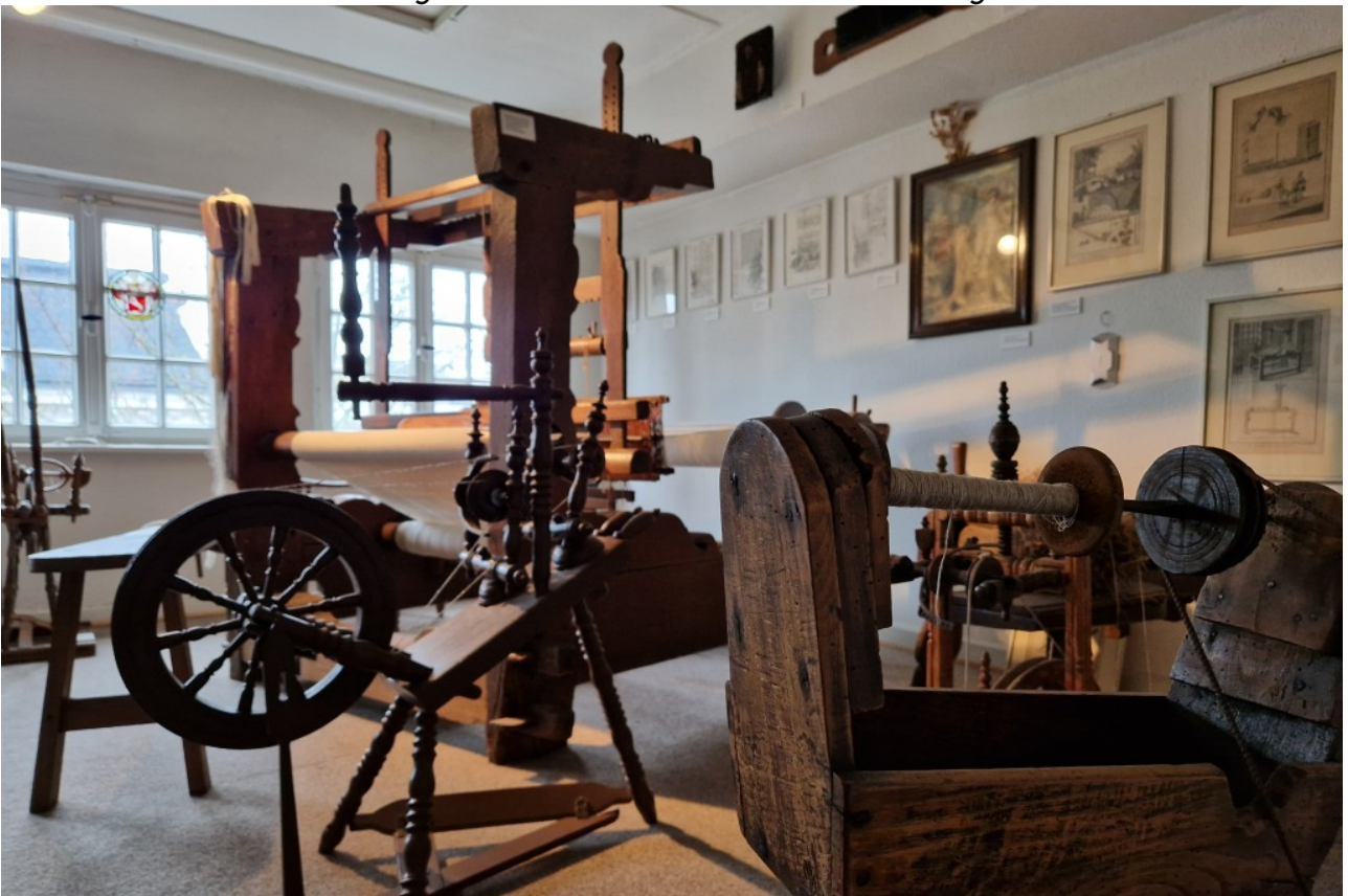
Textil-Handwerk hat in Bocholt eine lange Tradition.