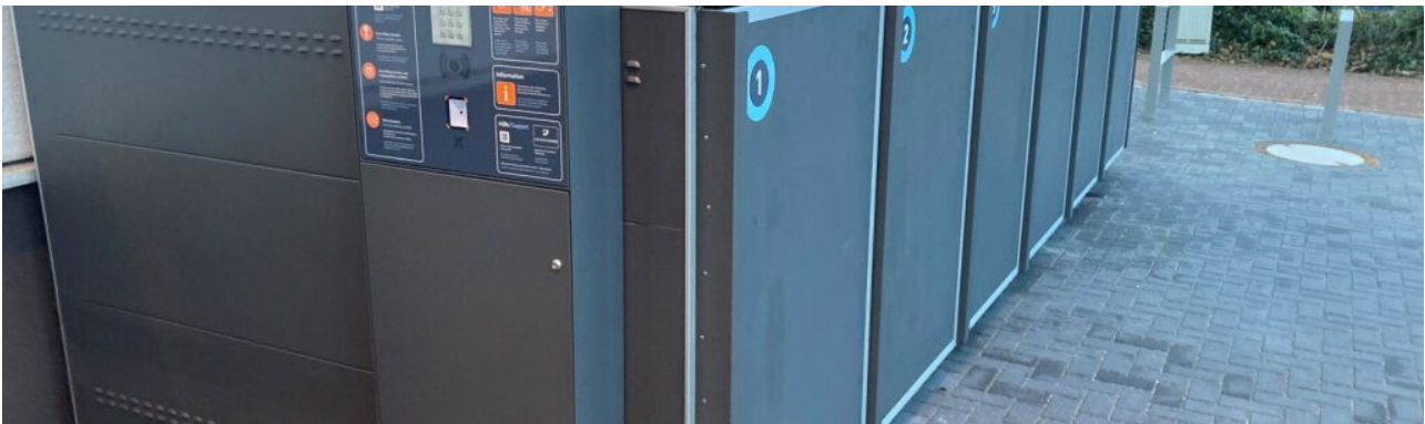
Bike box at the arcades ►