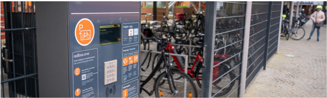
Bike box at Liebfrauenplatz ►