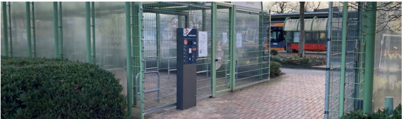
Bike box at the railway station ►