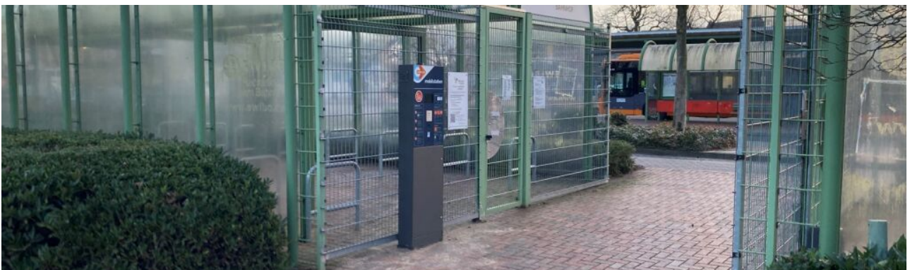
Bike box at the railway station ►