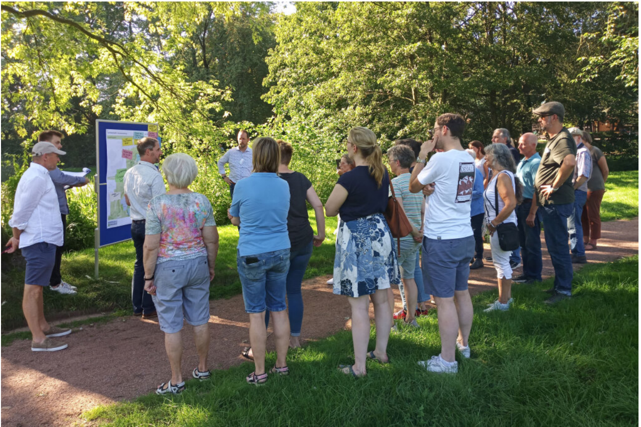
Citizens actively shape the new park at the Sandbach (duck pond)