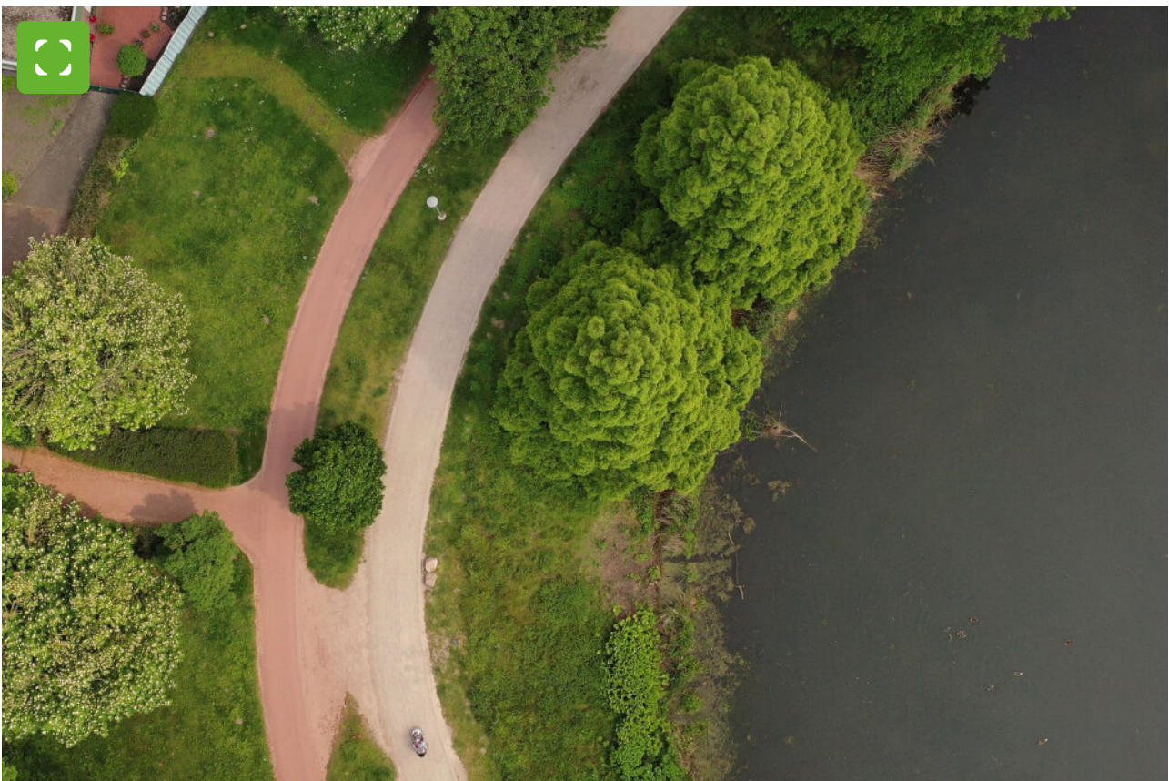
The cycle paths at the Aasee are being renovated

The access roads from Antoniusstraße and Kunfbachstraße will be closed. Access to the leisure facilities on the Aasee will also not be possible from the Aasee side for the duration of the project.