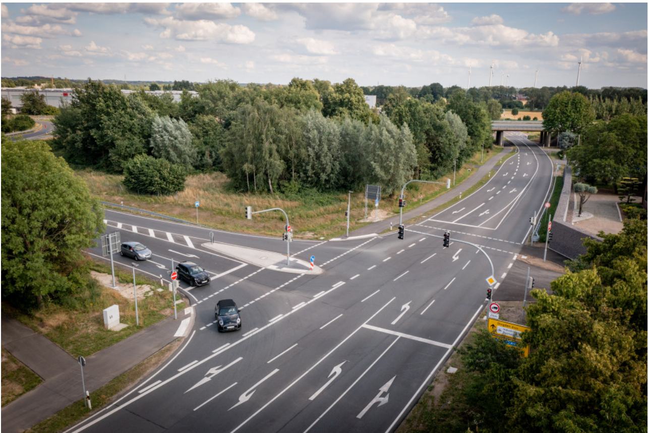
Thanks to new traffic lights and improved traffic routing, traffic flows on Mussumer Ringstrasse (here looking south) are better controlled.