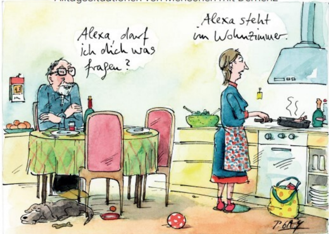
Peter Gaymann: Demensch- Alltagssituationen von Menschen mit Demenz aus dem DEMENSCH-Postkartenkalender, www.gaymann.de

Alltagssituationen von Menschen mit Demenz