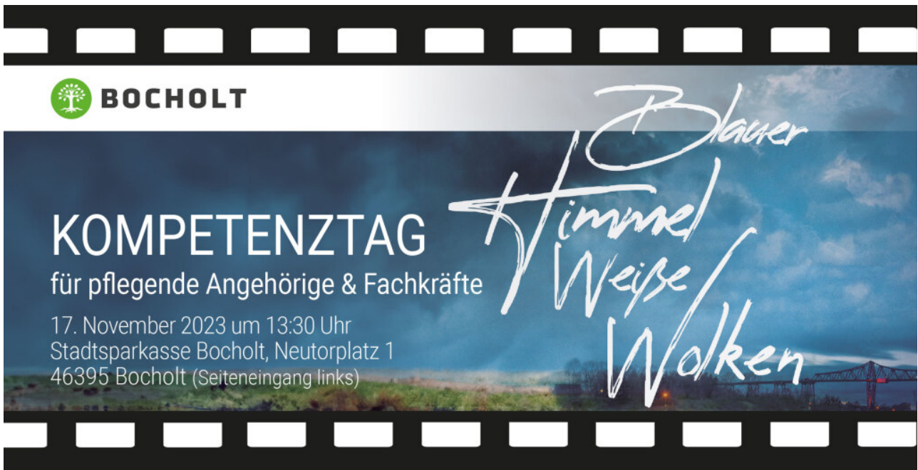
Flyer for the Competence Day - front page