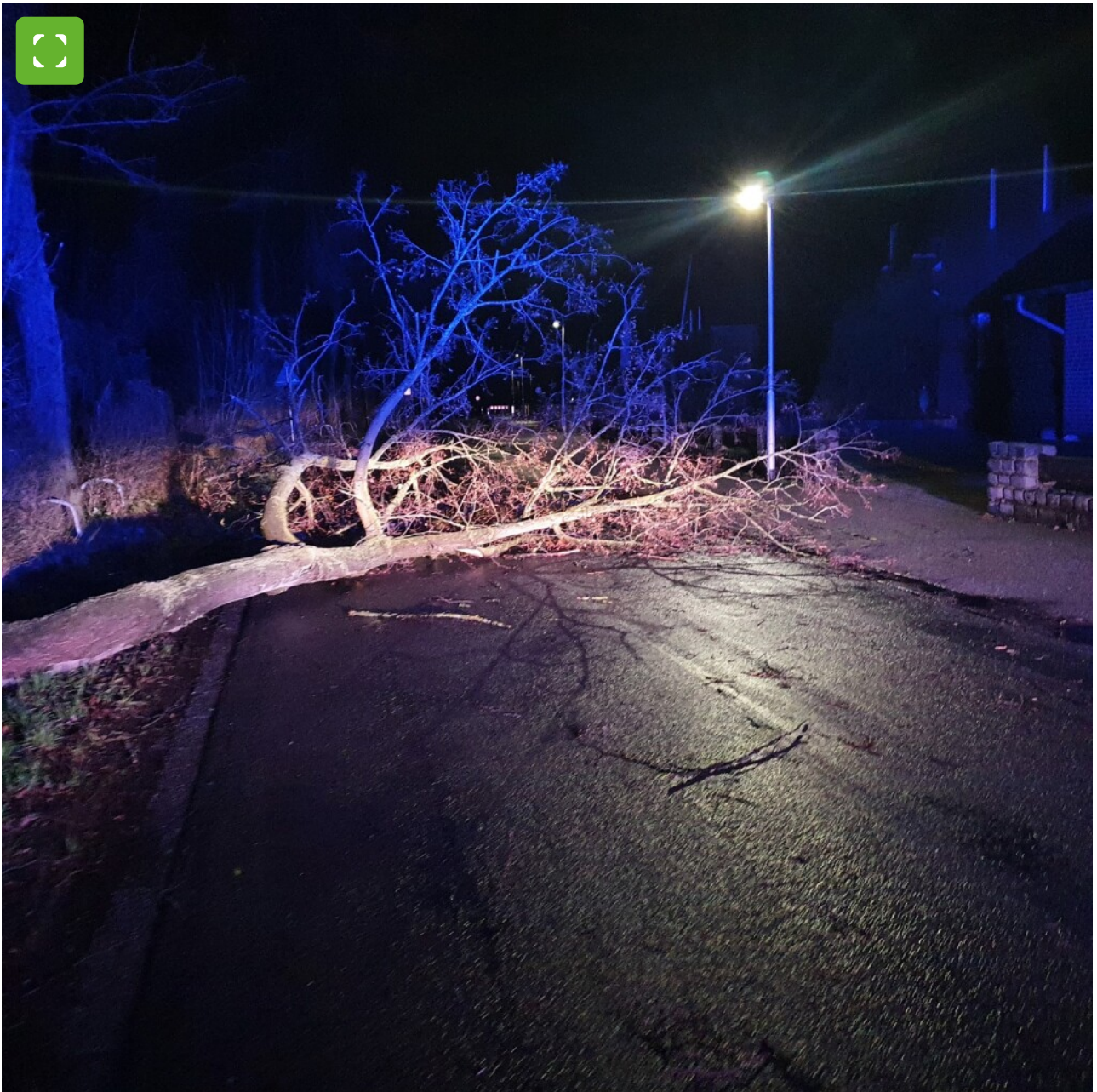
Umgekippter Ahorn versperrt Barloer Weg