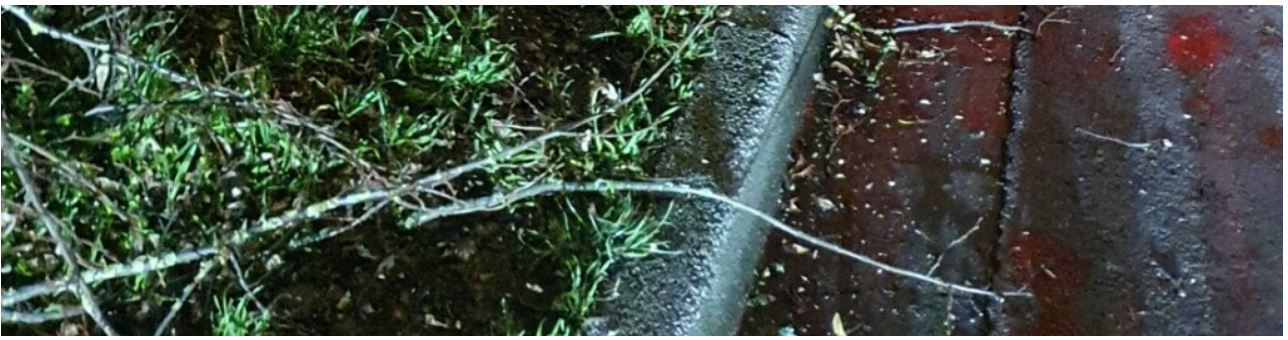
ESB beseitigt umgekippte Linde auf Dinxperloer Straße in Bocholt.