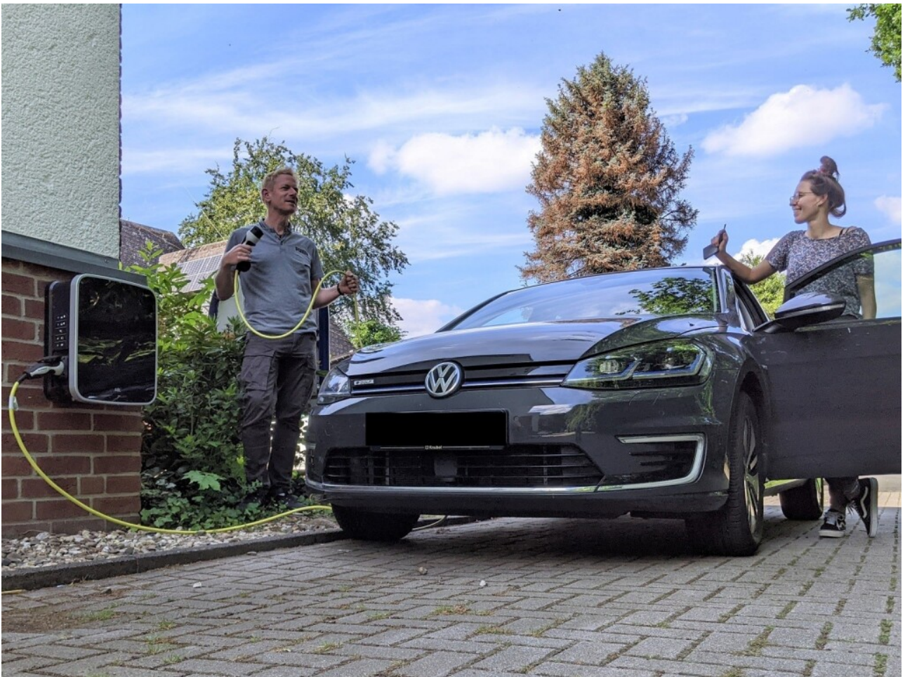
E-Carsharing kann auch in Bocholt erprobt werden.