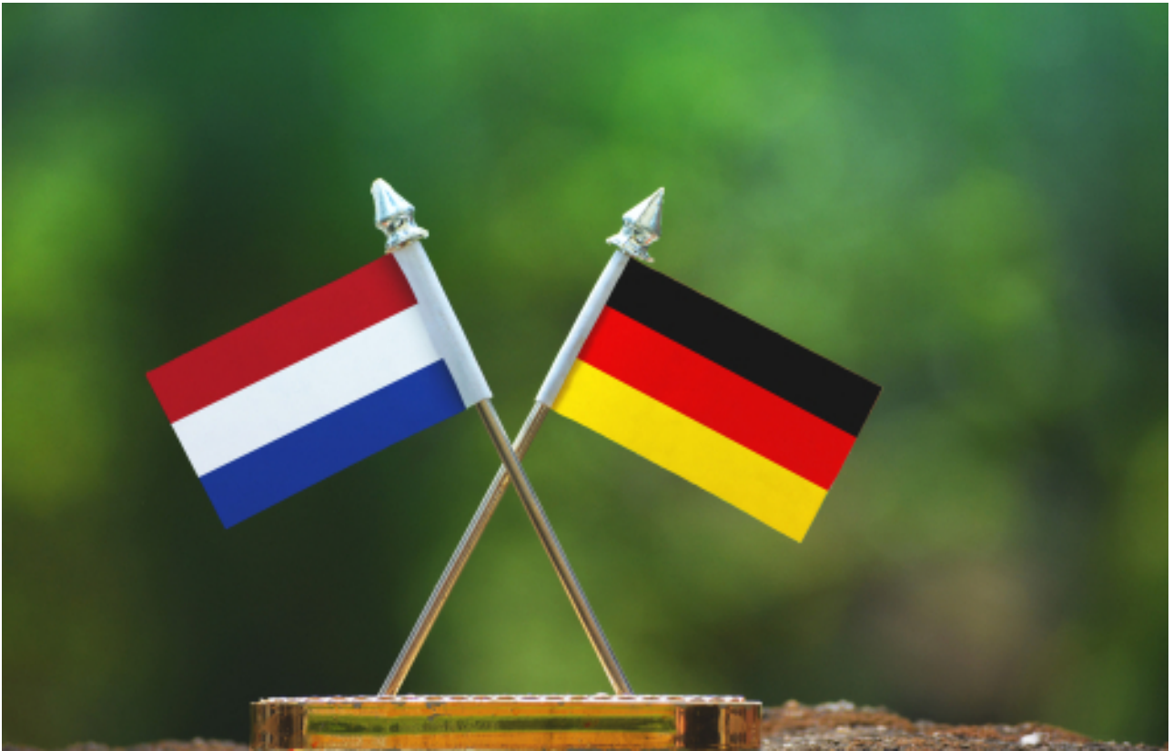
Deutsch-niederländische Flaggen.