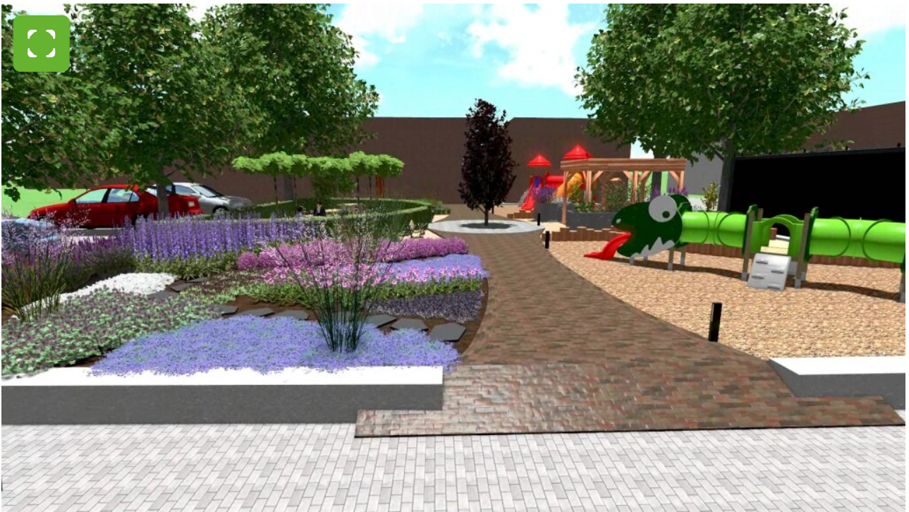
Sketch of the planned city garden at Liebfrauenplatz: a place to linger and play.