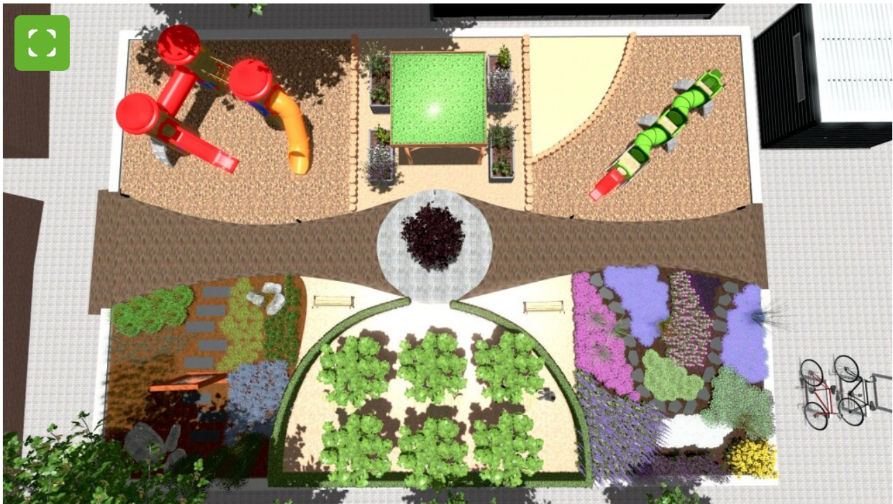
Green oasis in the city centre: this is what the new city garden, soon to be laid out on Liebfrauenplatz, looks like.