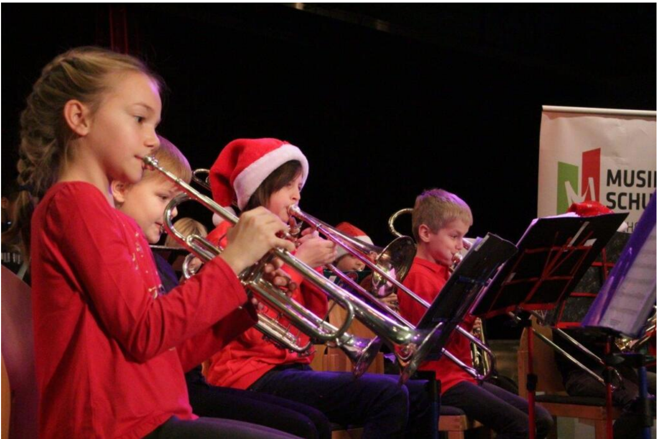
Weihnachtskonzert Musikschule Bocholt-Isselburg 2022