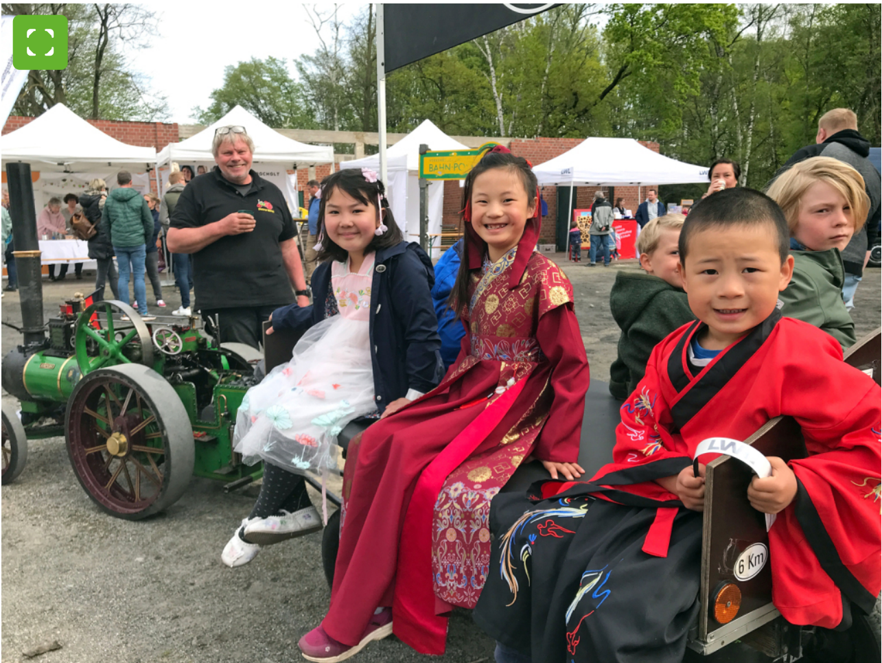
A ride on the steam tractor was a "must" at the family festival on 1 May

Minister für Bundes- und Europaangelegenheiten, Internationales sowie Medien des Landes Nordrhein-Westfalen und Chef der Staatskanzlei