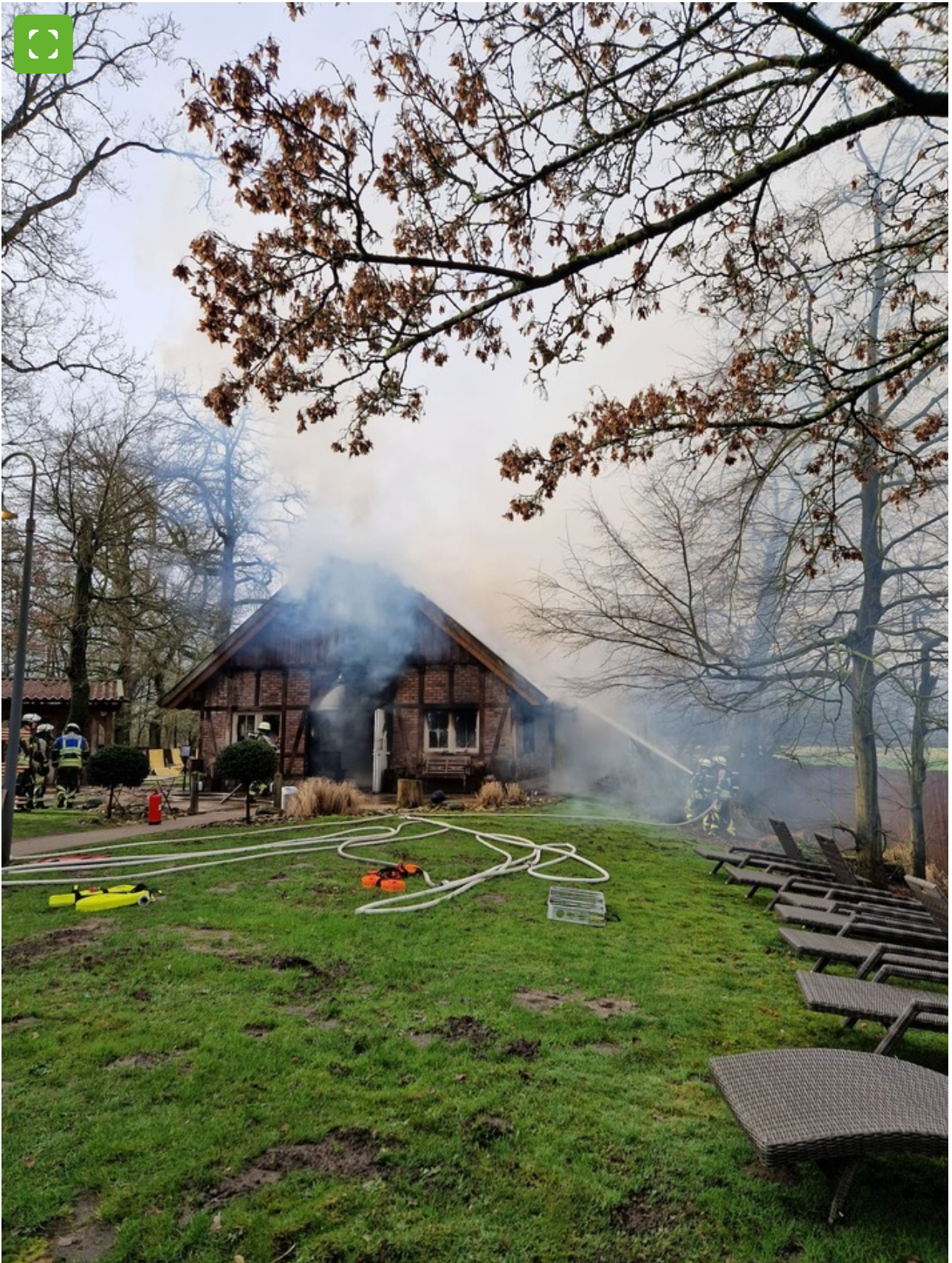
Sauna fire 3 of 3