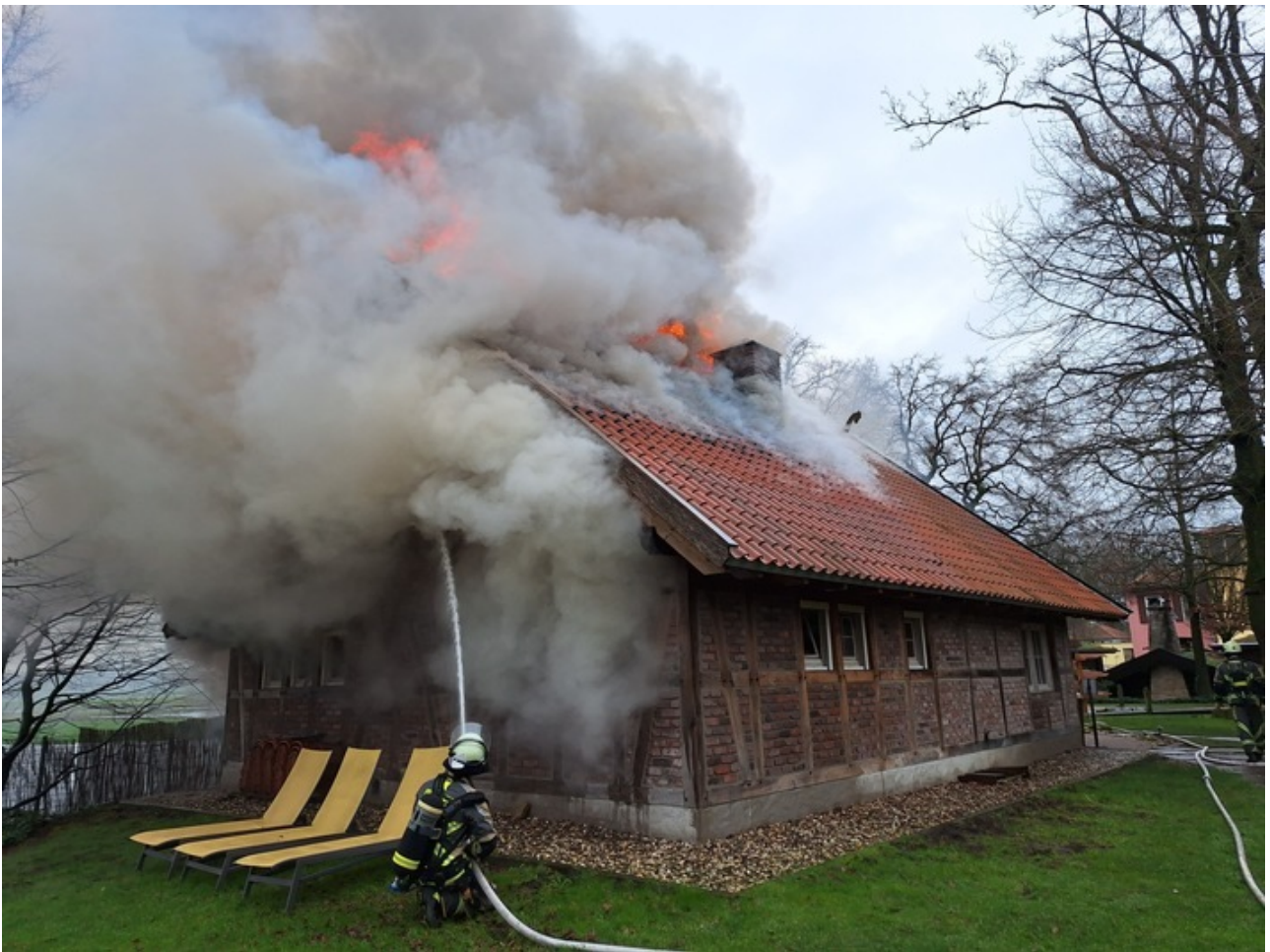
Sauna fire 2 of 3