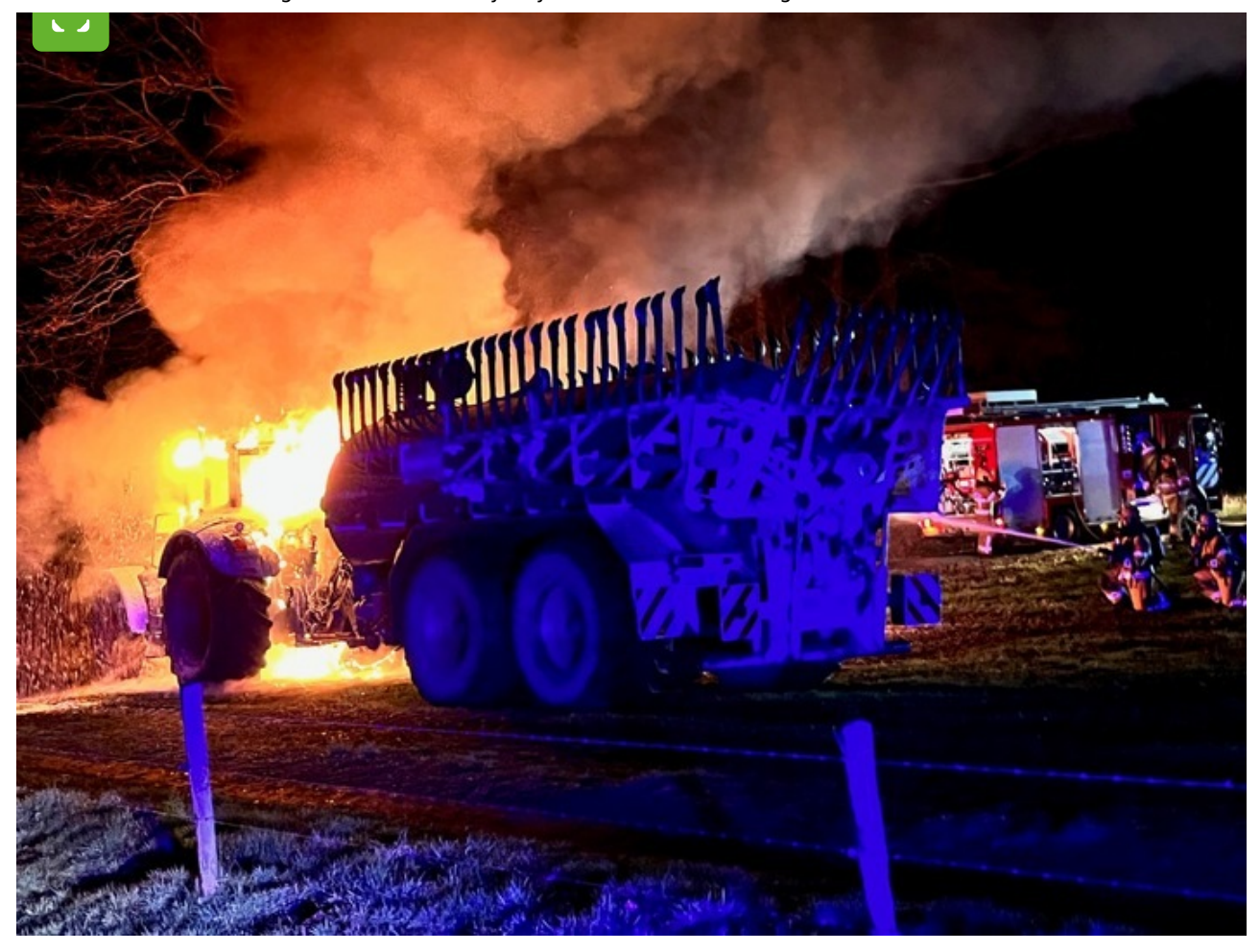
Burning tractor is extinguished by the Dutch Brandweer.

Instagram: @stadt.bocholt \mid Facebook: fb.com/stadt.bocholt \\