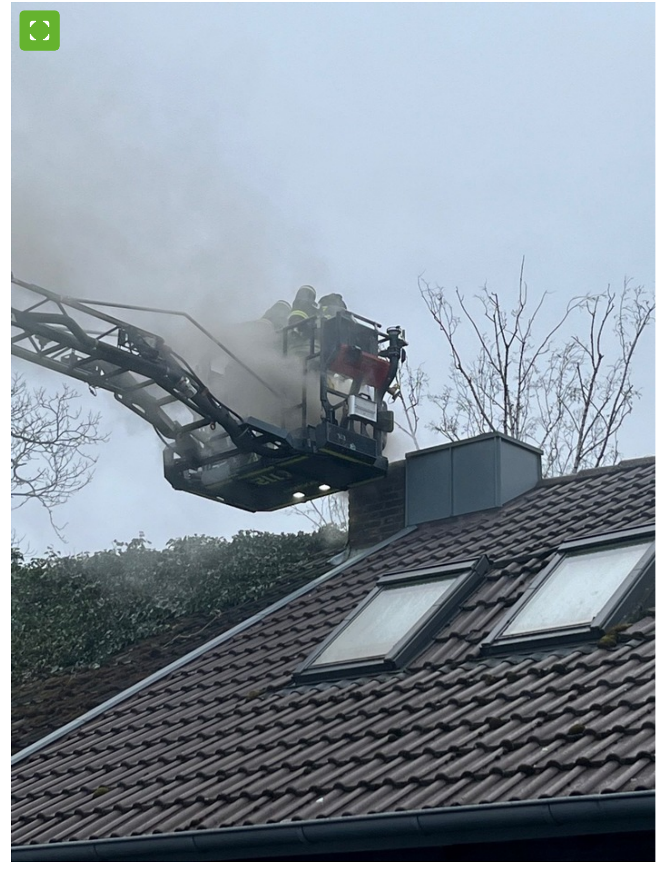
Burning chimney is swept from the turntable ladder basket.

Instagram: @stadt.bocholt | Facebook: fb.com/stadt.bocholt