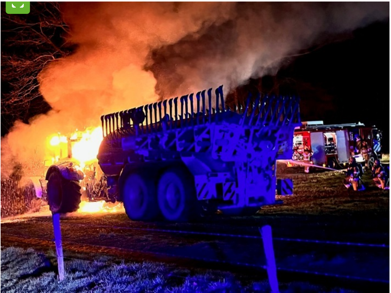
Burning tractor is extinguished by the Dutch Brandweer.