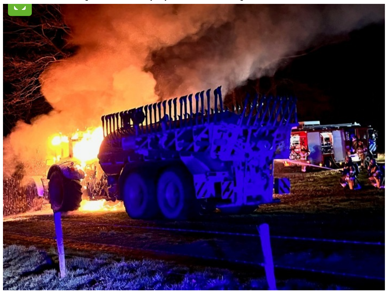
Burning tractor is extinguished by the Dutch Brandweer.