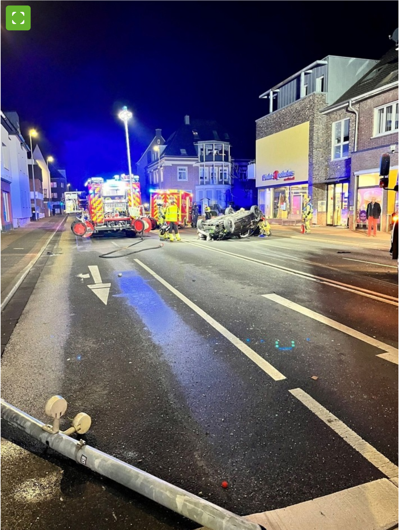
Vehicle lying on its roof on Ostwall after serious traffic accident.