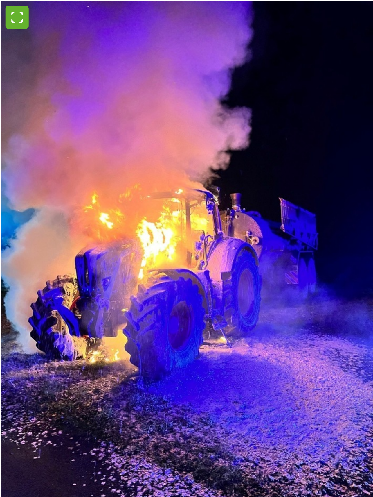
Tractor burns to the ground.