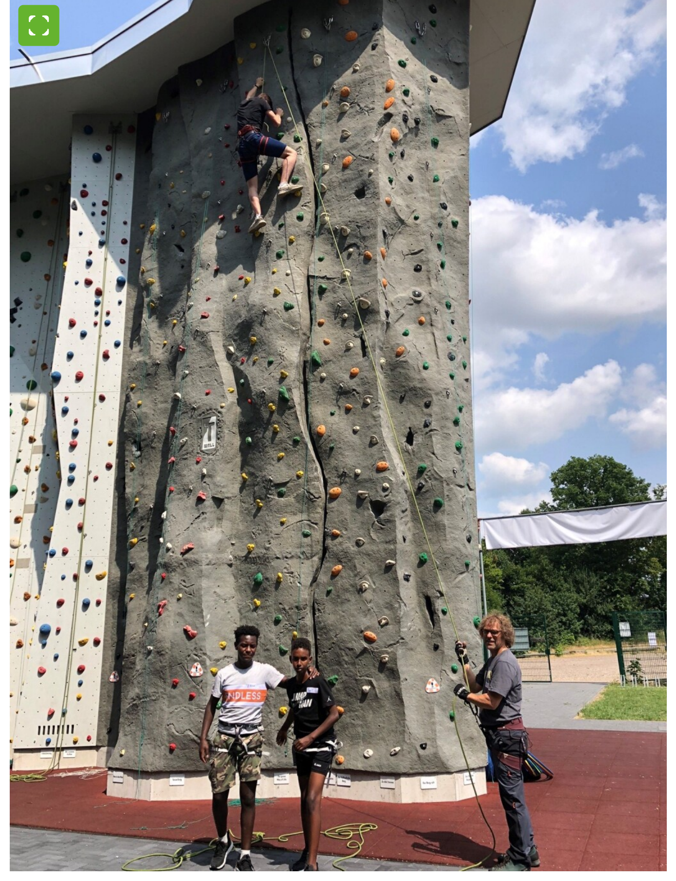
The "SonsBerg" climbing park takes you high above the ground