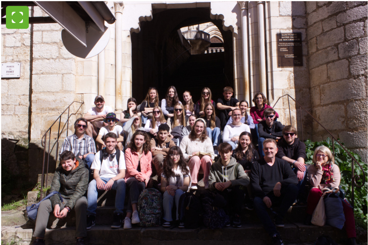
Pupils from Bocholt spent some eventful days in the French twin town of Aurillac.