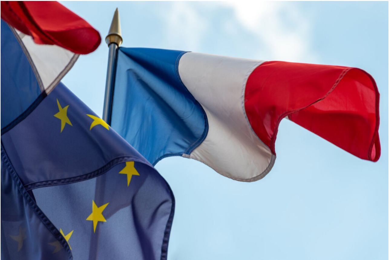
Symbolfoto: Frankreich- und Europaflagge