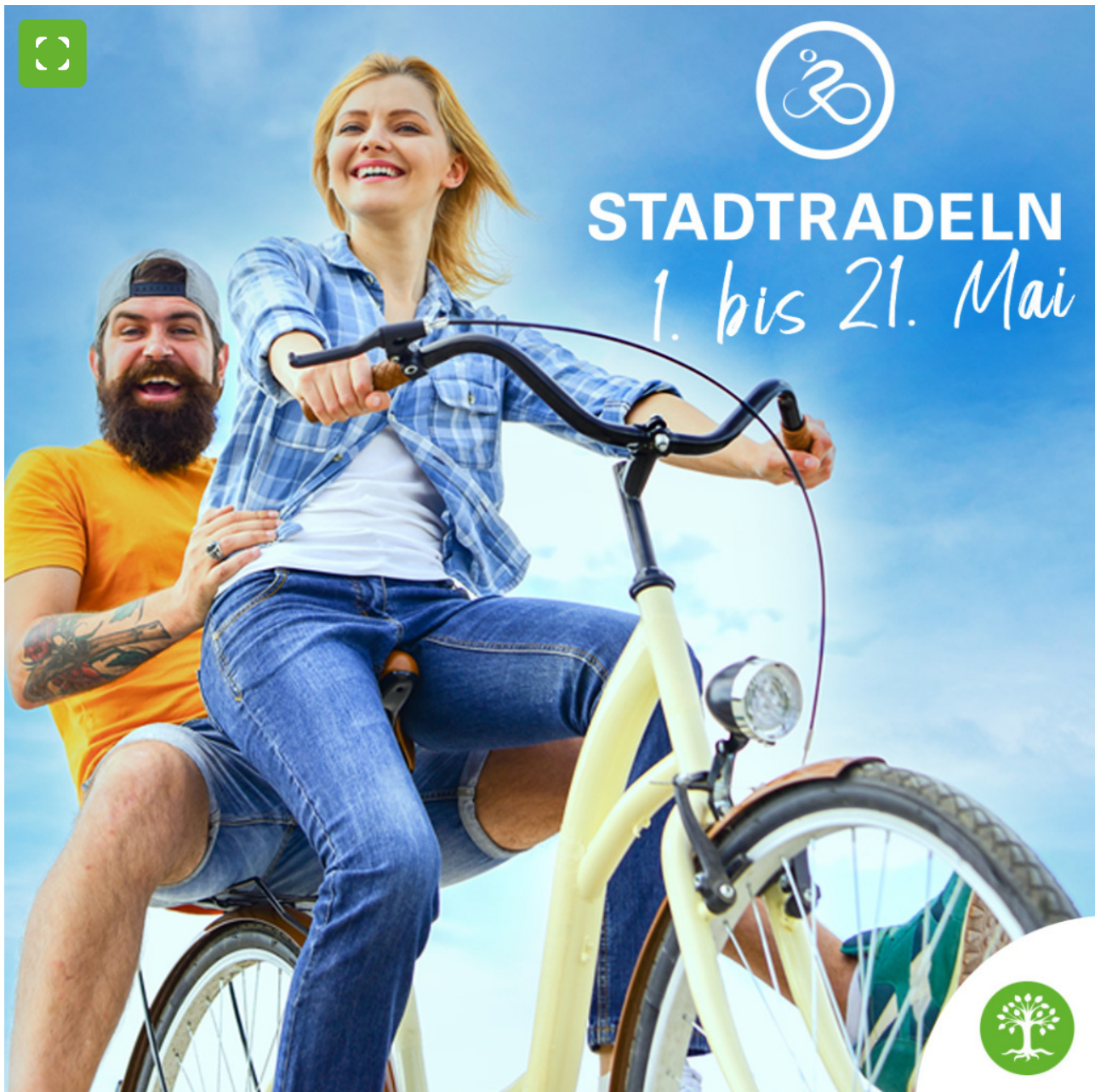
City cycling graphic

STADTRADELN is a competition in which the aim is to cycle as many everyday journeys as possible in a climate-friendly way for 21 days. The competition is organised by the Climate Alliance, a network of European municipalities. More information at www.stadtradeln.de