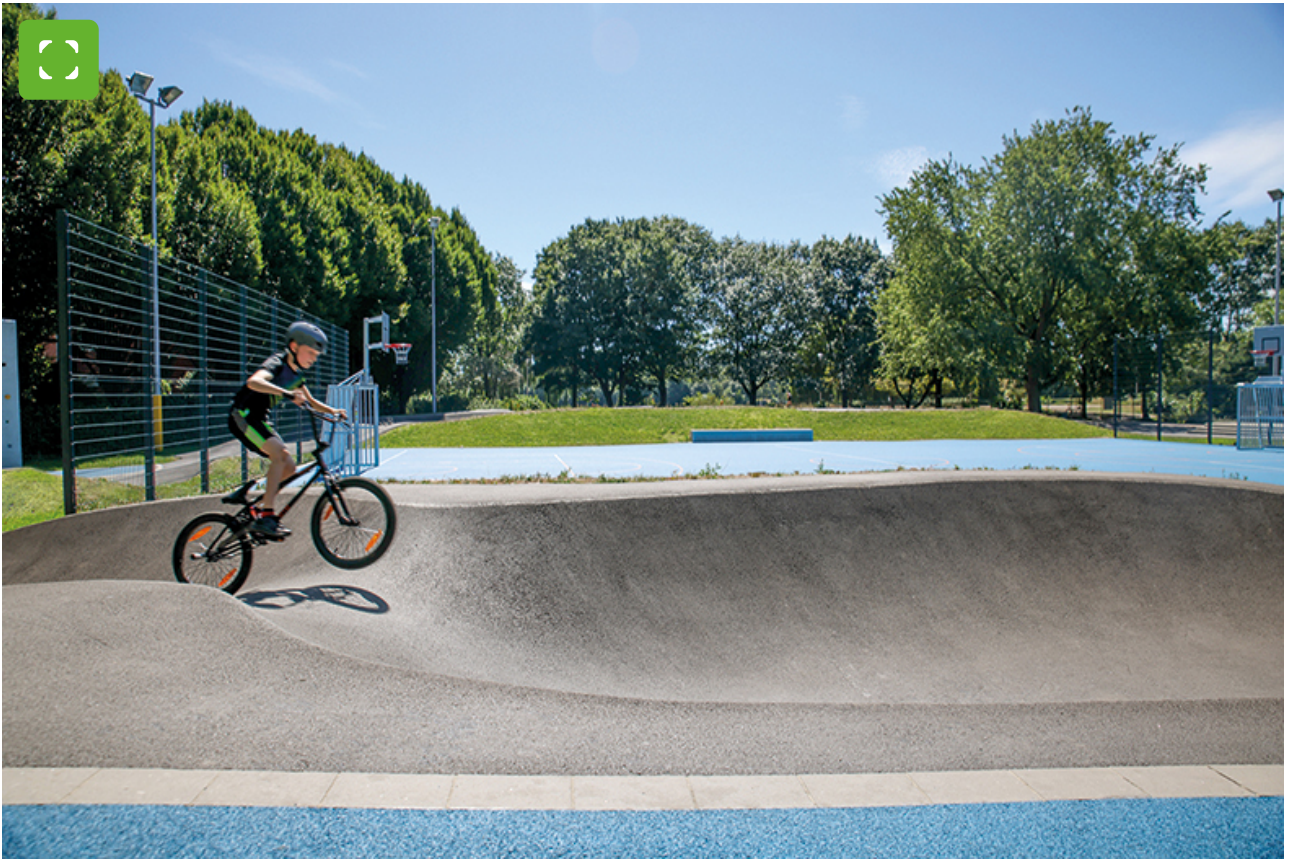
A course is available at the leisure centre.