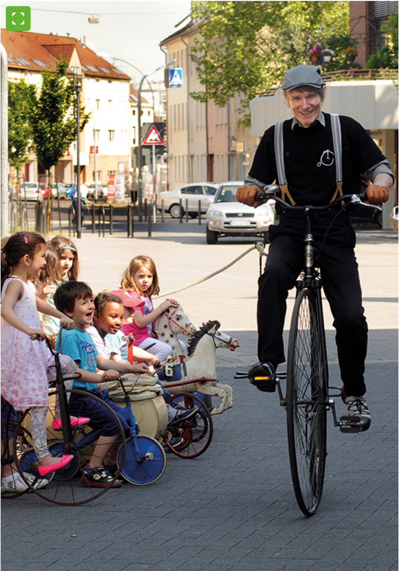
If you have the courage and desire, you can ride a historic penny-farthing.