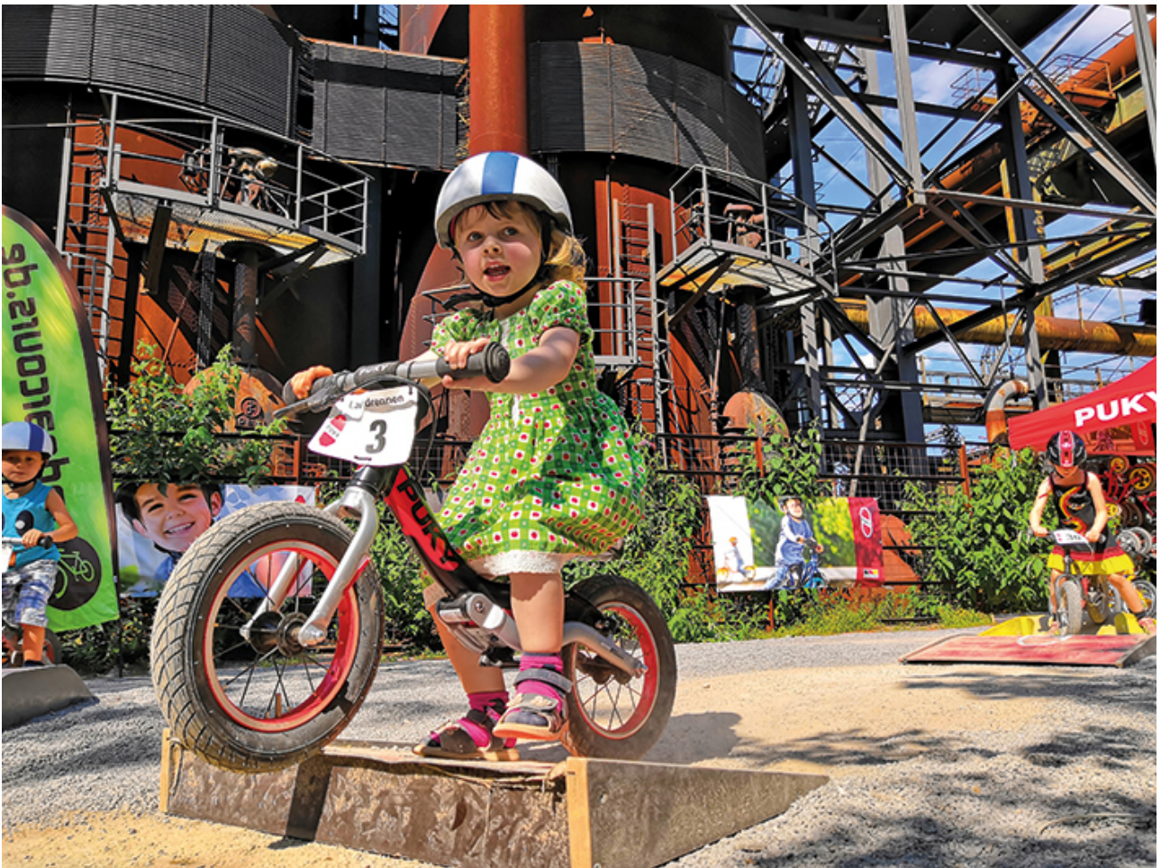
RADTRENDS in Bocholt delights cycling fans of all ages.