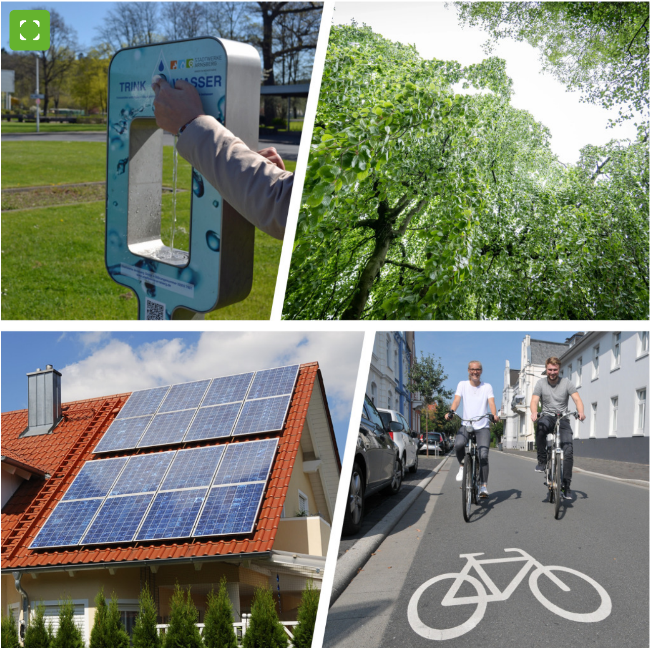
Citizens can now submit ideas for better climate protection in Bocholt.