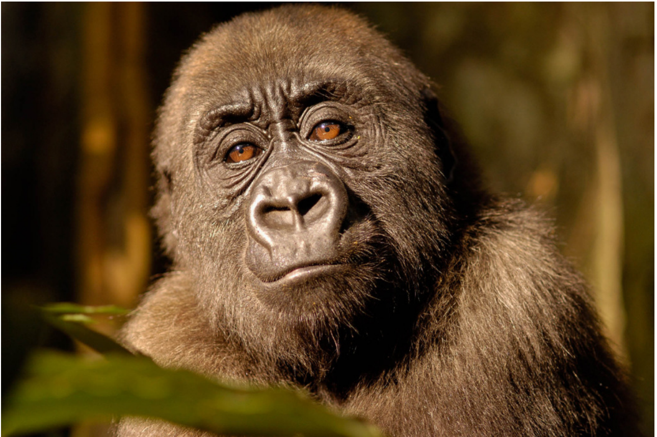
Die besten Bilder des Naturfotografen Markus Mauthe zeigen die Naturwunder dieser Welt und führen das Publikum auf fast allen Kontinenten durch die relevanten Ökosysteme.