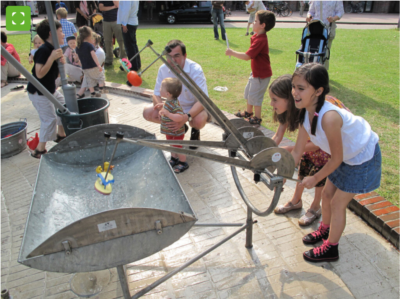
Discover sound and music in a playful way - at the sound art festival in Bocholt

The water orchestra consists of a total of 50 instruments that produce sounds of water or need water to produce sound. The music play activity is suitable for up to 50 people at a time and also offers children, as young as 2 years old, a great opportunity to make music themselves. The arrangement of the instruments encourages the participants to become musically active together.