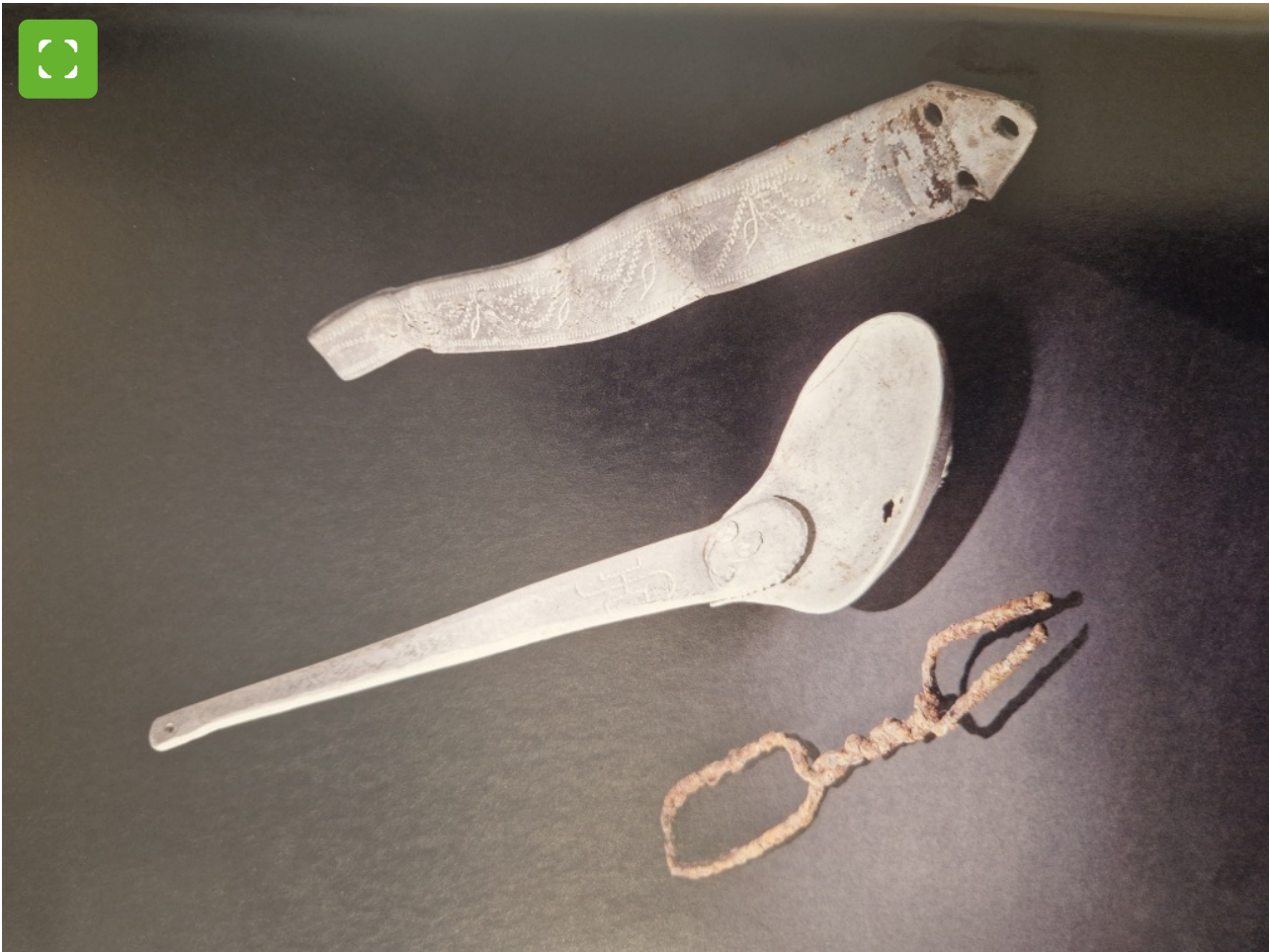
Improvised cutlery of prisoners of war from the former Bocholt prison camp "STALAG VI F".