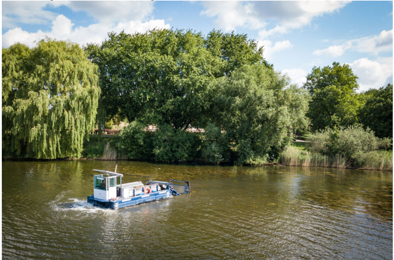
The mowing boat is on the move again on Bocholt's Aasee lake