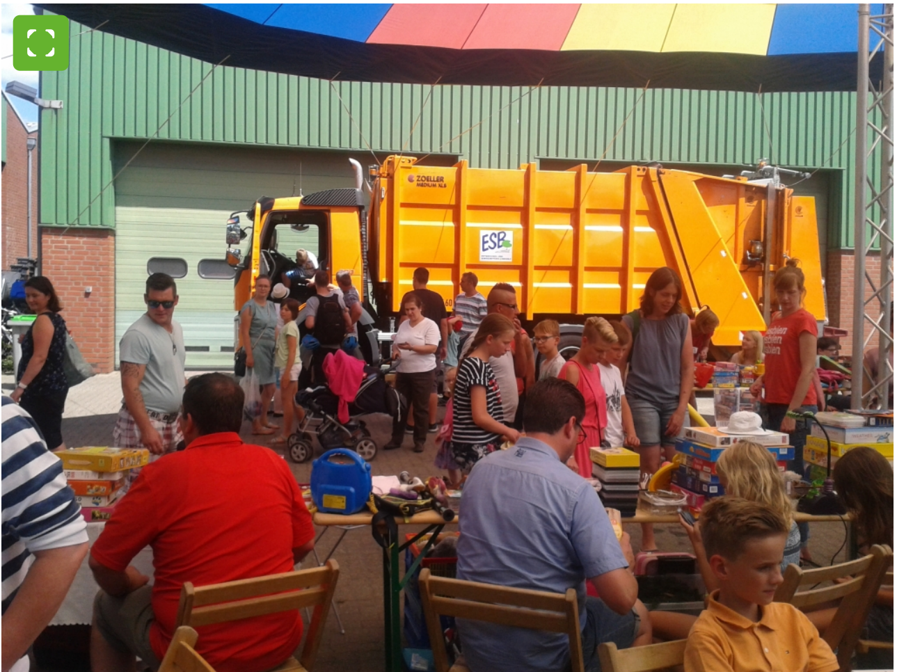
Kinderflohmarkt beim ESB Bocholt