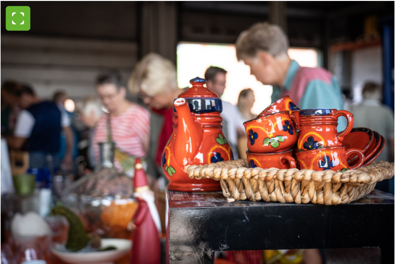
Große und kleine Schätze gibt es bei der ESB-Spermmüllbörse zu entdecken und zu kaufen