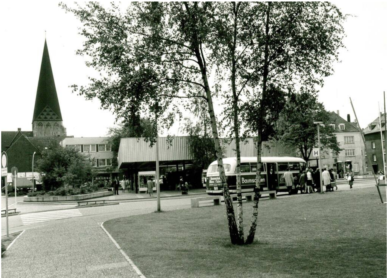
The new Central Bus Stop (ZOH)