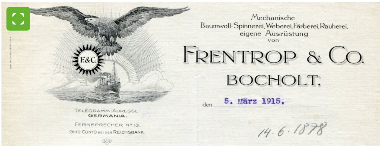
Letterhead of the Bocholt textile factory Frentrop & Co with steamship and eagle on the ocean