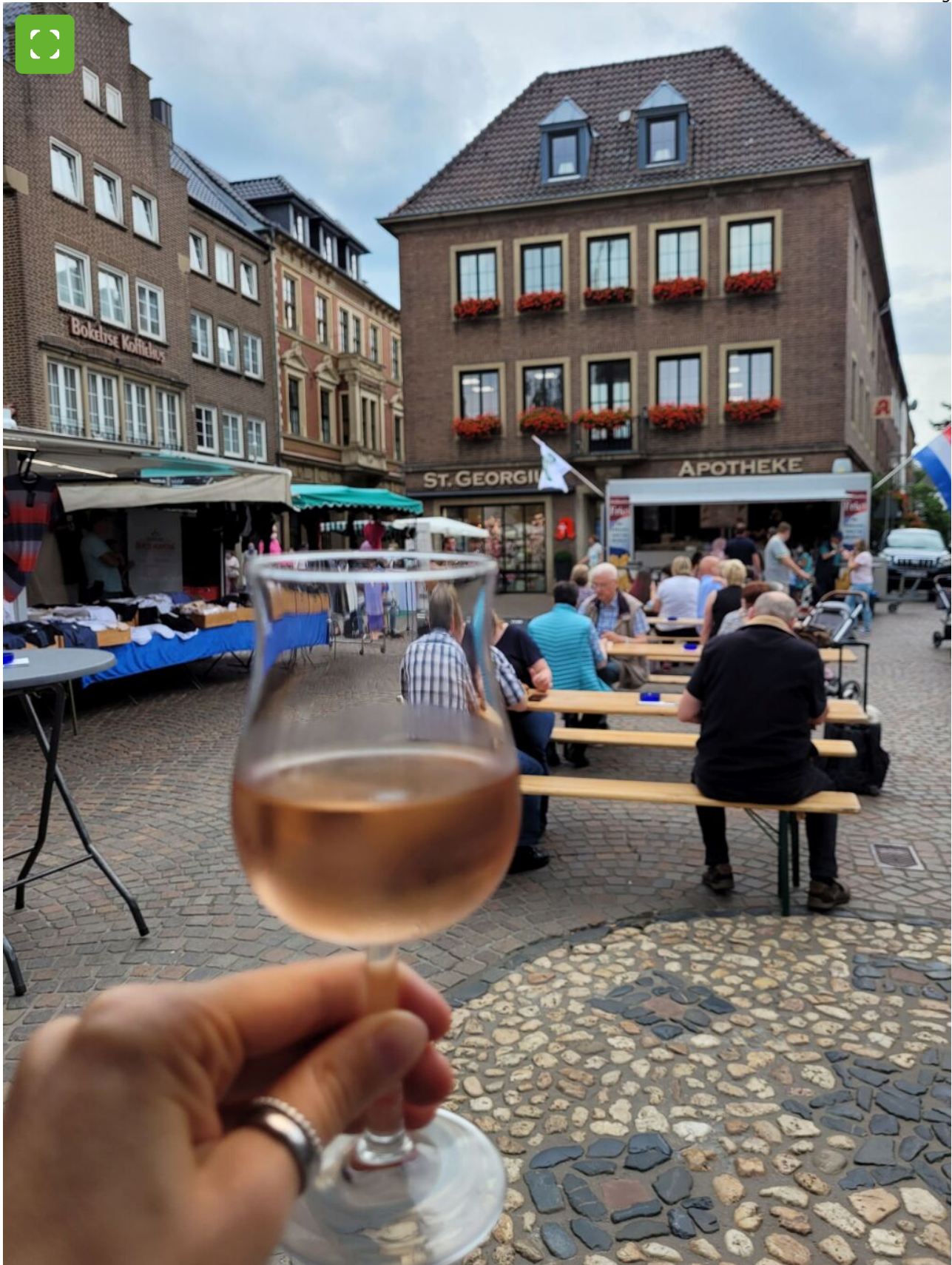
Gourmet break at the evening market in Bocholt.

Kaiser-Wilhelm-Straße 52-58, 46395 Bocholt