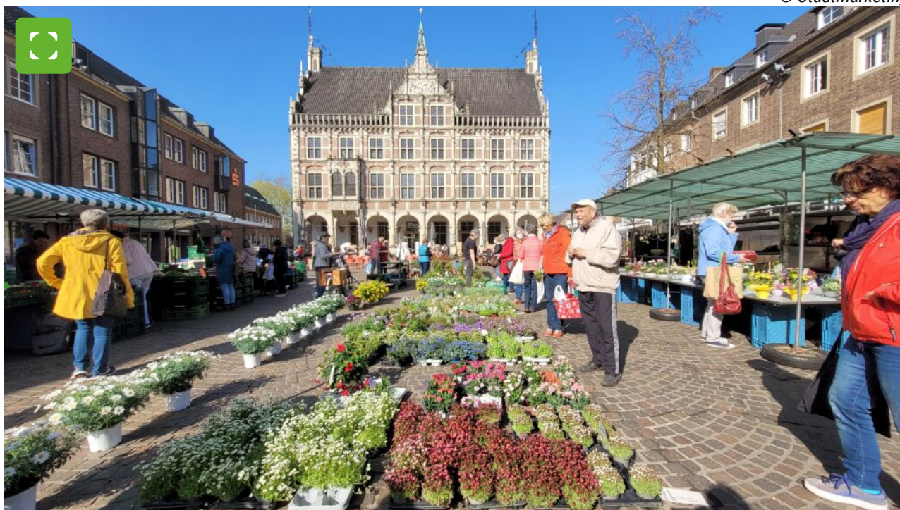
Weekly market in front of Bocholt's historic town hall.

The town of Bocholt is located in the western Münsterland region in the north-west of North Rhine-Westphalia and, with 71,000 inhabitants, is the largest district town in the Borken district.