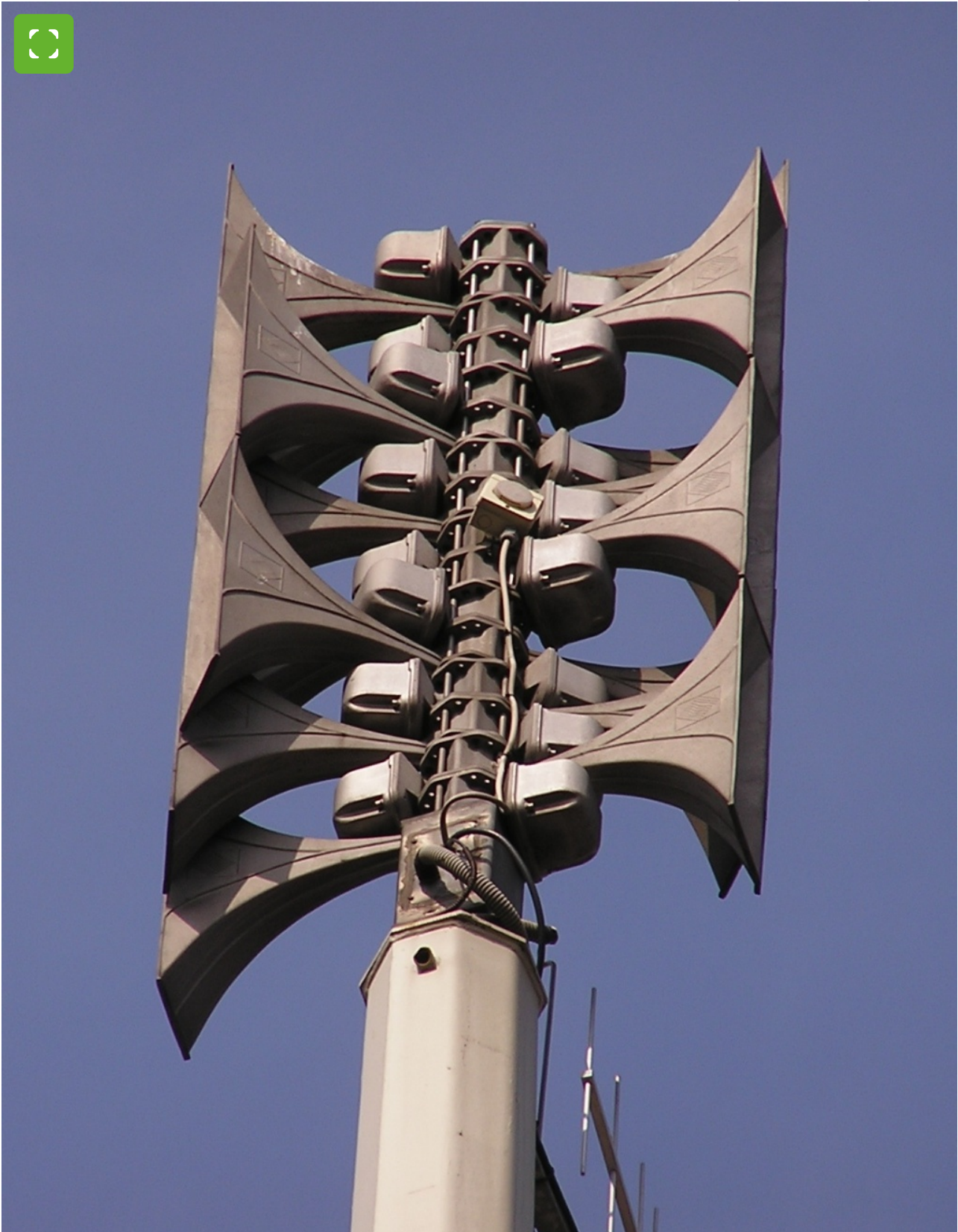
Example of an electronic siren