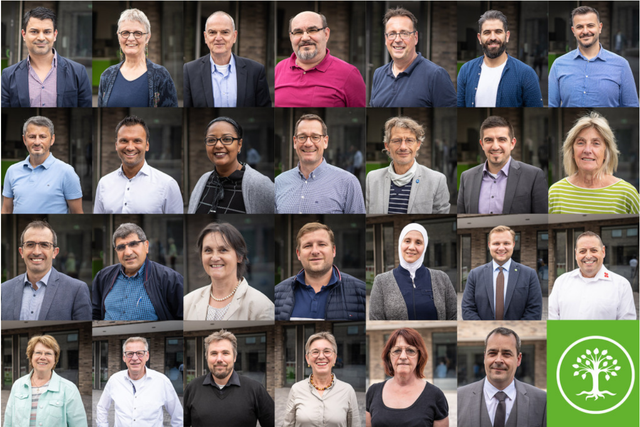
The members of the municipal integration council