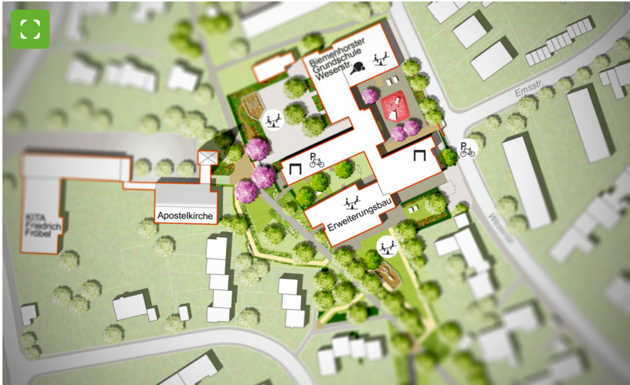
The Biemenhorst Primary School (Weserstraße)