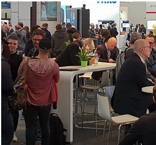
Bocholter Jobbörse ▶