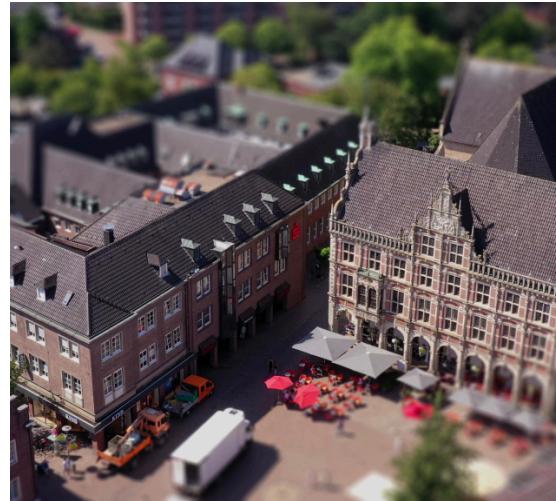
Service Onboarding@Münsterland ▶