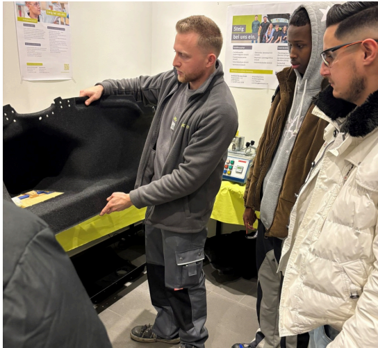
Night of training ▶

The shortage of skilled labour poses major challenges for companies. To help you in your search for the right skilled labour, you will find various projects and event formats presented here that have been established in and around Bocholt, were/are successful or are being offered for the first time.