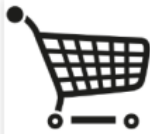
Shopping & Service