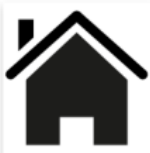
Leben & Wohnen