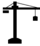
Planen & Bauen