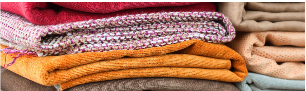
Old clothes ►