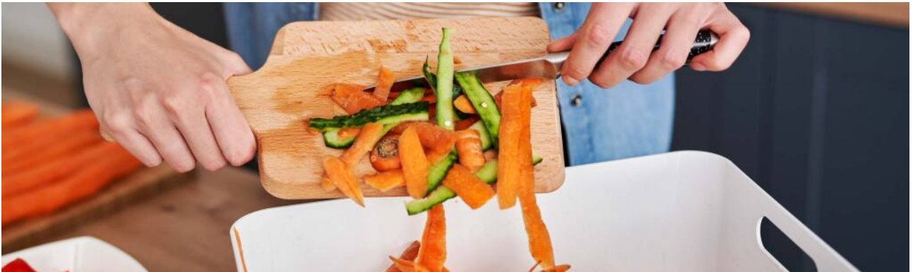
Organic waste ►