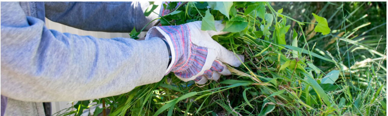
Green waste collection ►