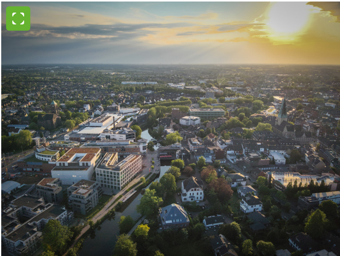
View of Bocholt city centre.