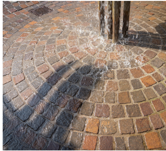
Urban planning ▶