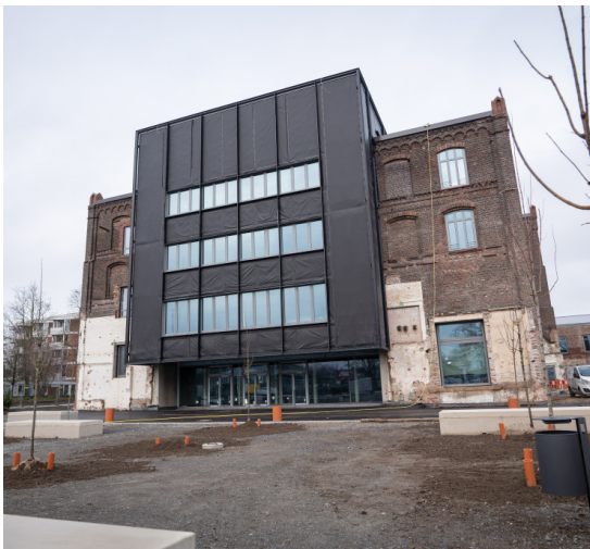
Urban development ▶