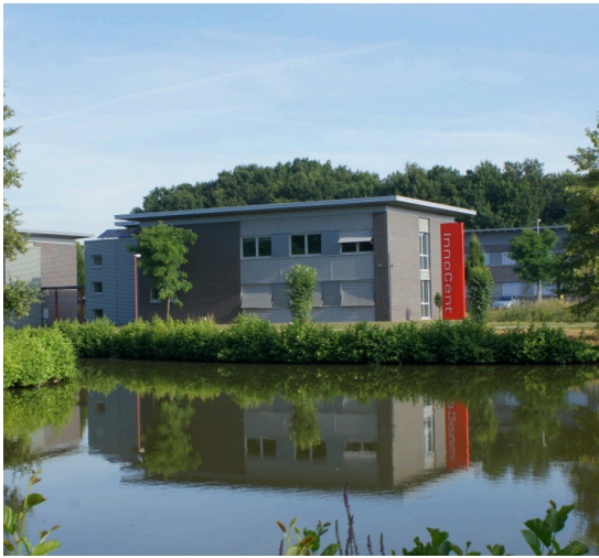
Commercial real estate ▶