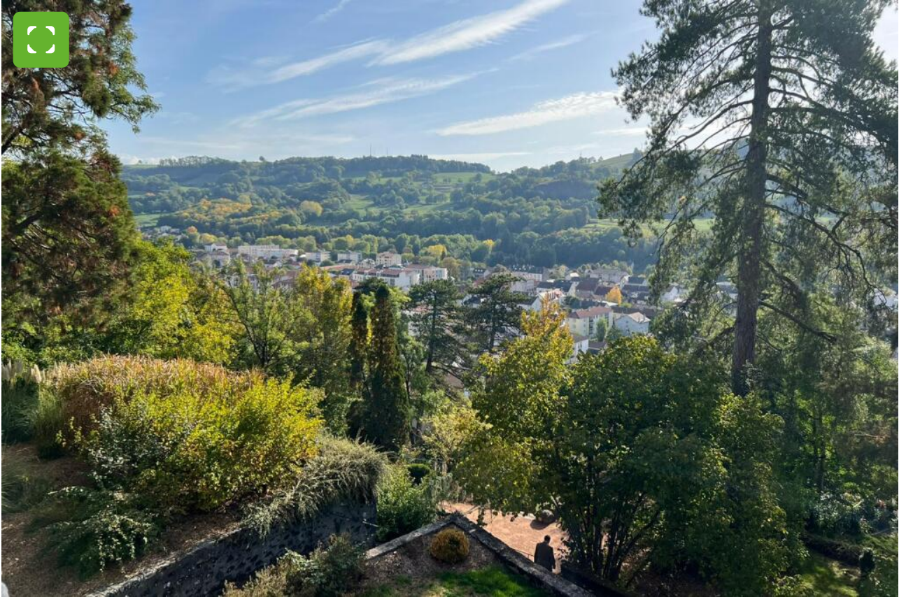
The town of Aurillac in France

Aurillac - the French twin town in the green heart of France has 26,876 inhabitants. It is located in the heart of Europe's largest volcano, which offers breathtaking landscapes. The city is the seat of the prefecture of the Cantal département with a central function. A large part of the administrative and services, shops and cultural and sports facilities are concentrated here.