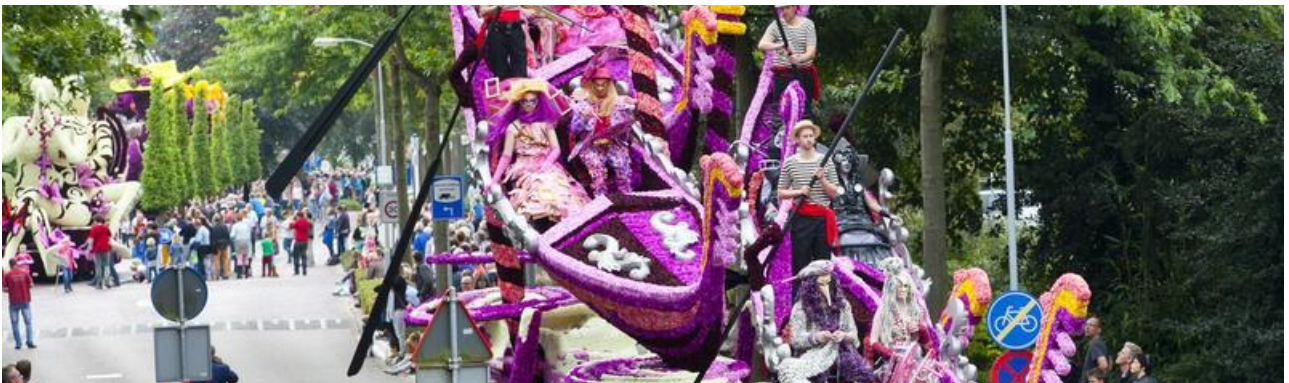
Oost Gelre ►