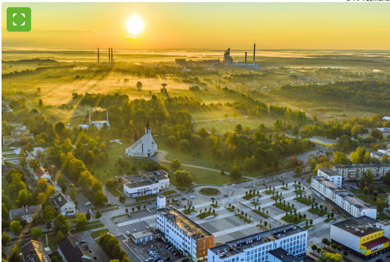
The House of Culture in Akmene

Akmenė - the rayon (cf. county) of Akmenė was established in 1949 in the north of Lithuania. Its area is 84 square kilometres. Akmenė has about 21,000 inhabitants and is located on the Latvian border. There are three towns: Naujoji Akmenė, Akmenė and Venta. In addition, the municipality of Papilė, the municipality of Kruopiai and more than 160 villages belong to the rayon.