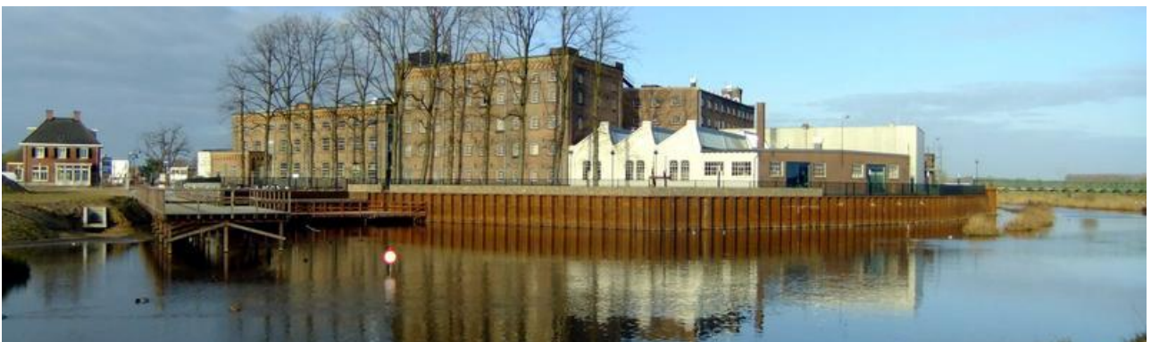
Oude IJsselstreek ►