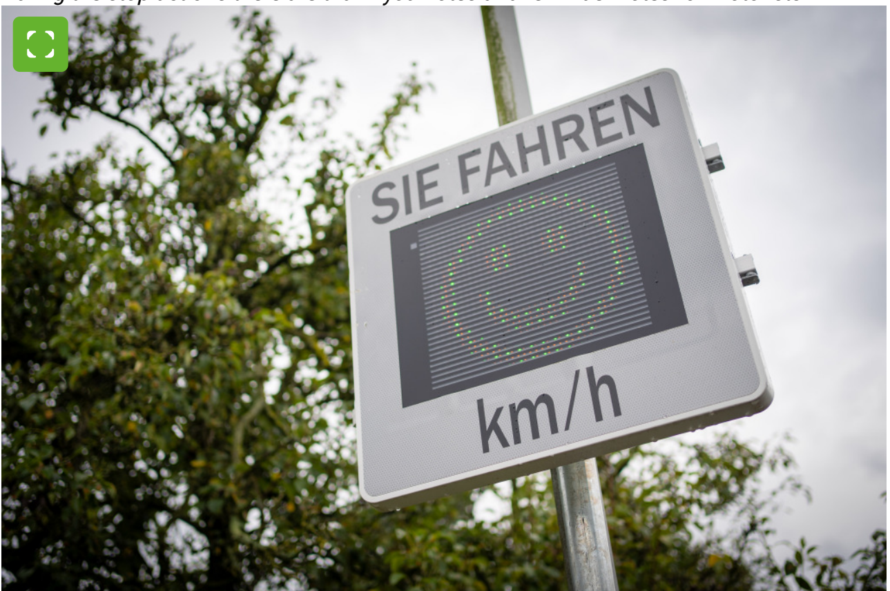
Speed control signs alert motorists to their speed