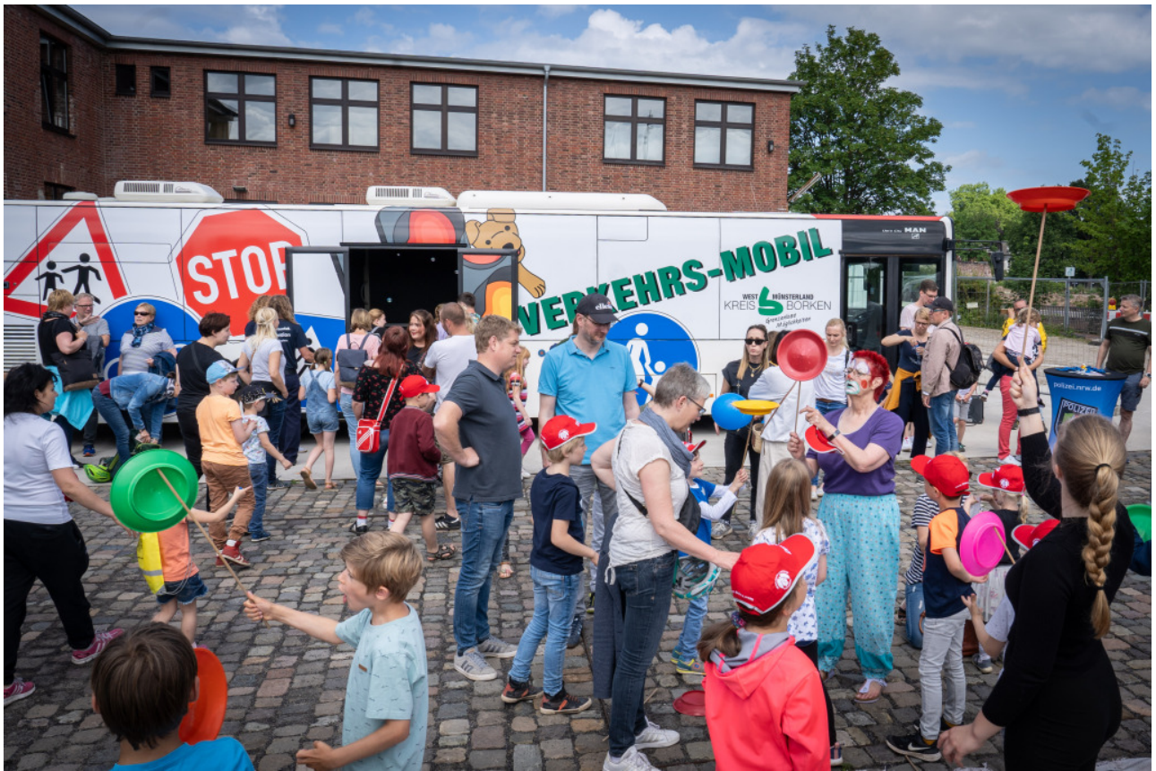
At the big road safety day there are activities around road safety