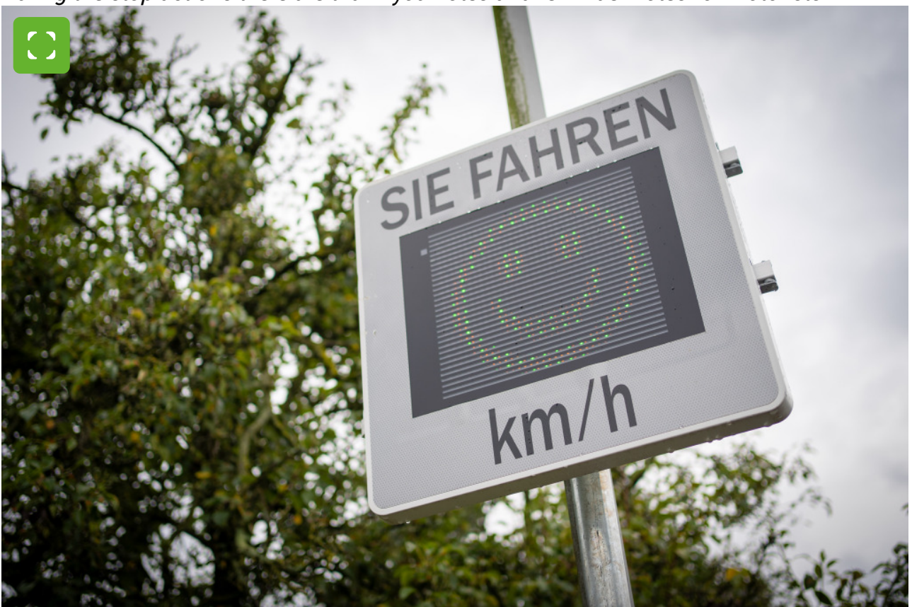
Speed control signs alert motorists to their speed