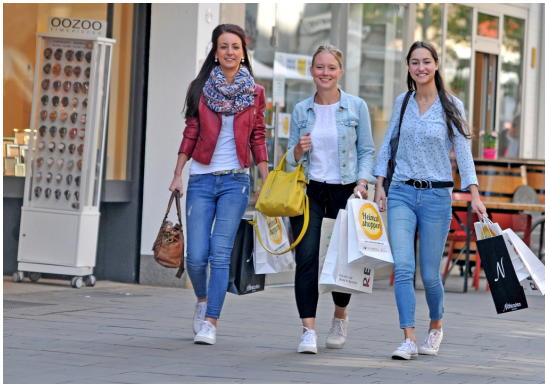
Shopping in Bocholt ▶