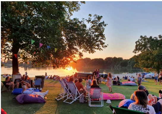
Experience and discover ▶