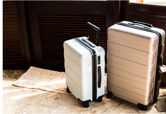
Stay overnight ▶