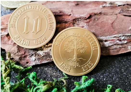
Bocholt Thaler ▶