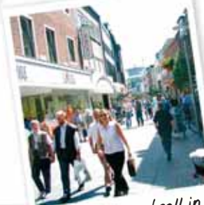
"A shopping stroll in the town centre"