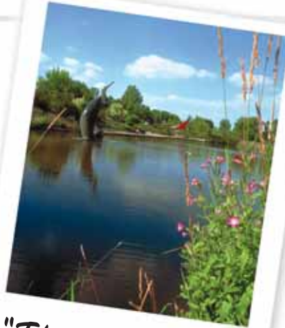
"The Aa Lake"

As a "bicycle paradise" for cycling tourists Bocholt has made a name for itself far beyond the immediate region. More than 200 kilometres of cycle tracks tempt you to undertake extensive tours around the town and through Münsterland. But Bocholt is more than that! Rest and relaxation in style and with a variety of possibilities for leisure and sporting activities - that is what goes to make up the town on the Aa.