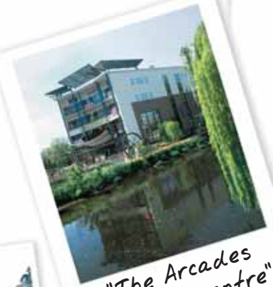
"The Arcades shopping centre"