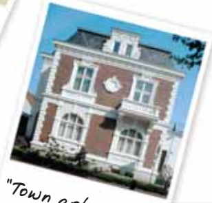
"Town art gallery"