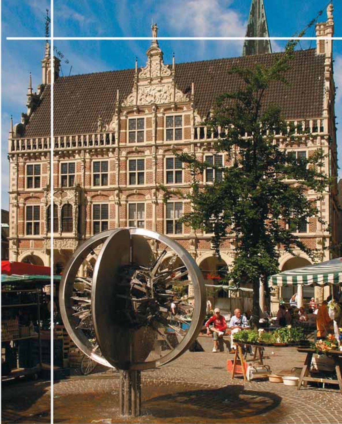
The historic Town Hall (1618 - 1624)