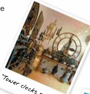
"Tower clocks museum"