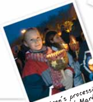
"Children's procession honouring St. Martin"