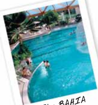
"The BAHIA leisure pool"