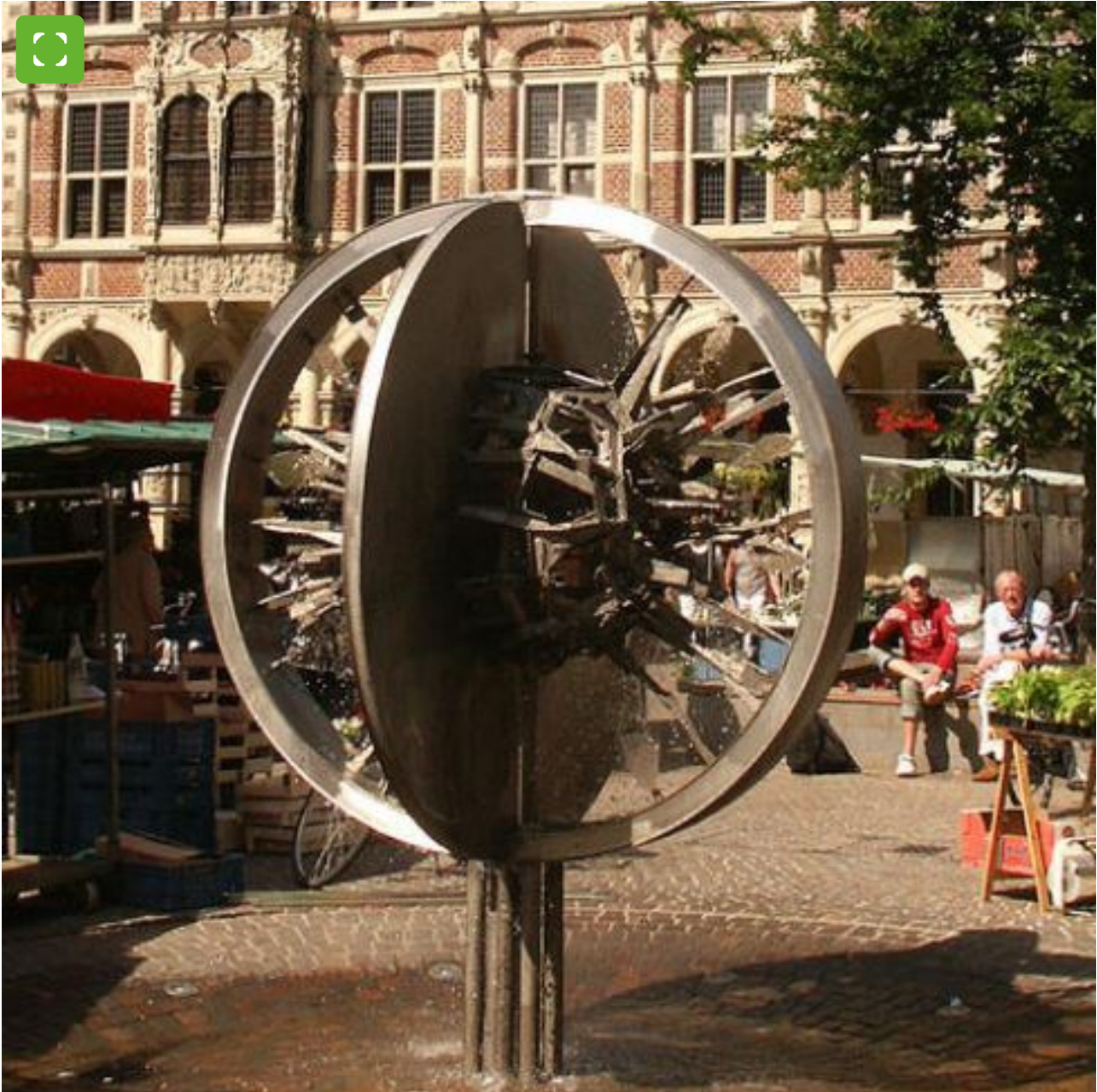
Europe Fountain in Bocholt

In 1972, Bocholt was awarded the honorary title "Municipality of Europe", followed by the European flags and the designation "European City". The awarding of the title was the occasion for the creation of the Europe Fountain in front of the Historic Town Hall. Artist Friederich Werthmann designed the steel sculpture for the 750th anniversary. He used a sphere in openwork form to represent it. The globe, the earth disk and the sun ring are symbolised.