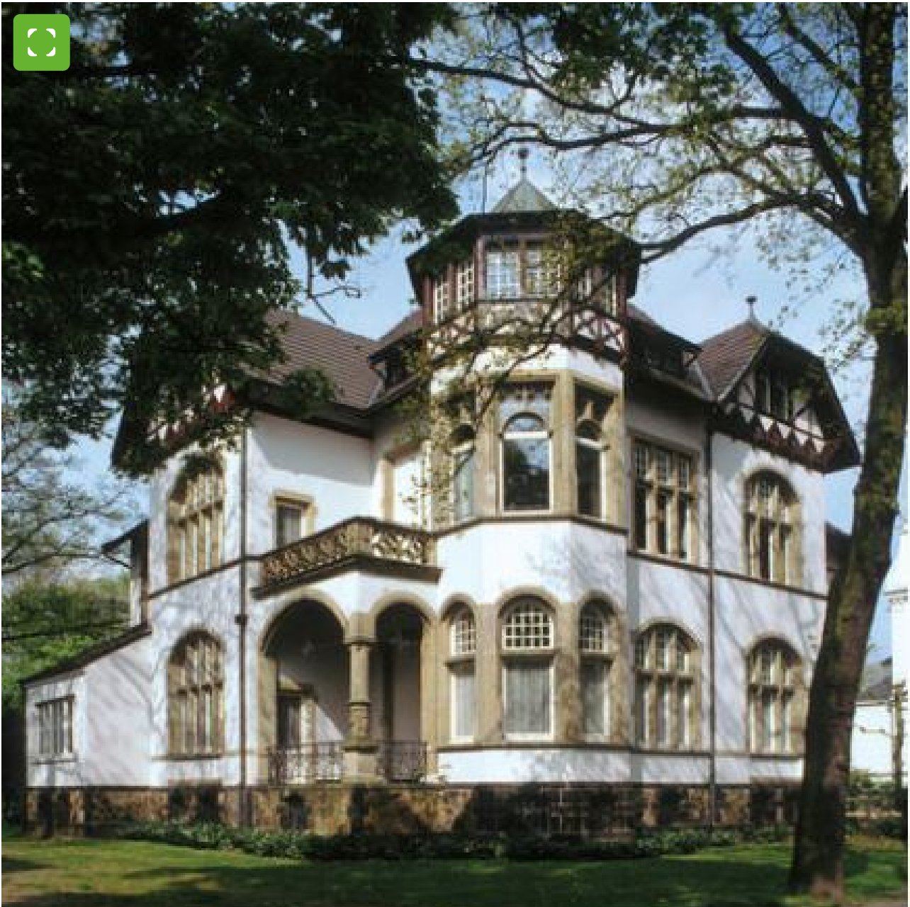
Salierstraße community centre in Bocholt

A historically interesting Art Nouveau building stands at Salierstraße 6, built around 1900. Today, it houses the music school of the towns of Bocholt and Isselburg.