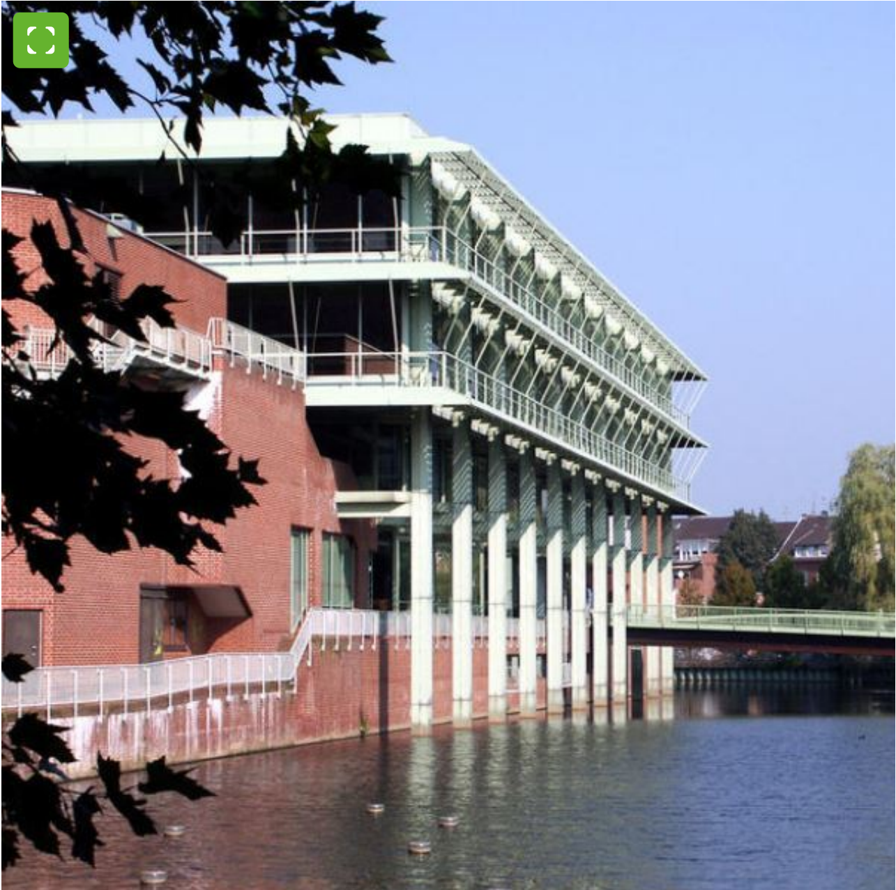
New City Hall Bocholt

Bocholt, the town with two town halls. On Berliner Platz is a town hall built in the 1970s with a cultural centre and theatre. It is the seat of the administration. (Note: The town hall is currently being renovated , as of 11/2022).