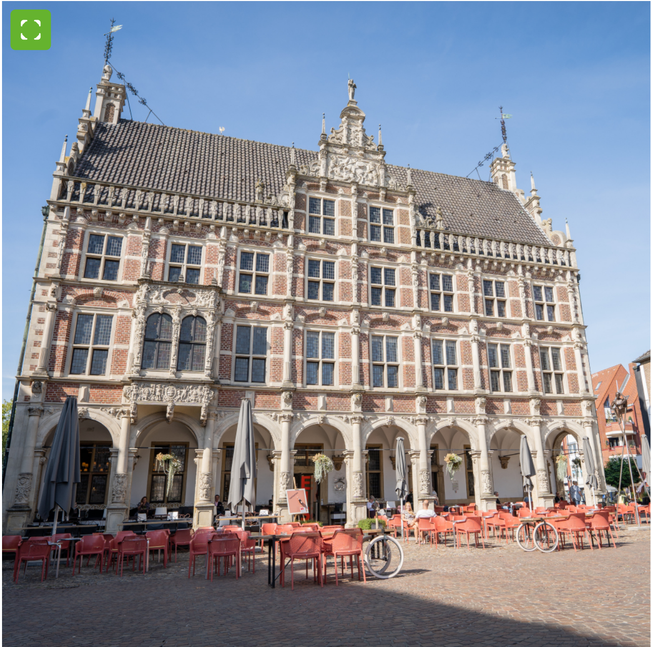
Historic town hall in Bocholt

The city's landmark, built 1618-1624 in Dutch Renaissance style. Destroyed and rebuilt after the end of the Second World War. Together with St. George's Church, the oldest building in Bocholt, the Historic Town Hall on the market square forms the centre of the town. The wedding room is a popular place to get married.