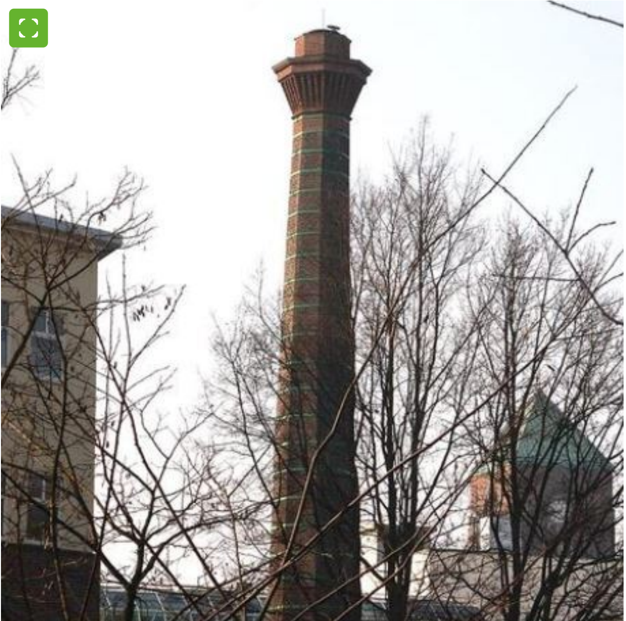
Historic masonry chimney in Bocholt

The masonry chimney is an industrial monument near the shopping arcades. The 32-metre-high relic from 1857, the age of industrialisation, is built in an octagonal shape with iron bands on a square base.