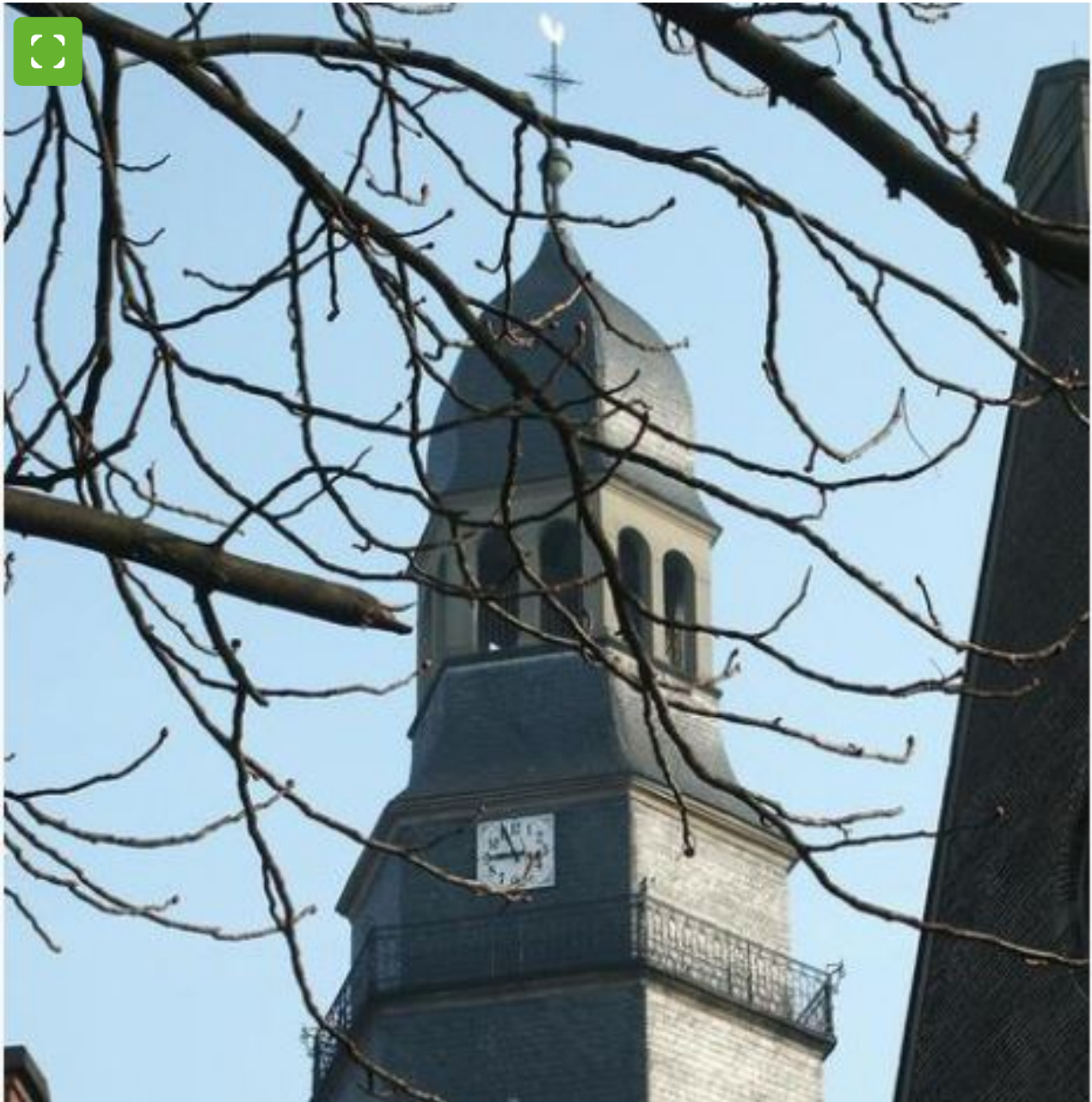
Liebfrauen Parish Church Bocholt

The Liebfrauenkirche is a Catholic parish church, formerly a Minorite monastery church, built between 1785 and 1792 in the late Baroque style. The church was extended between 1912 and 1913. After the town church of St. George, the Liebfrauenkirche was planned around 1310 as the second parish church in the town. The building was completed in 1316.