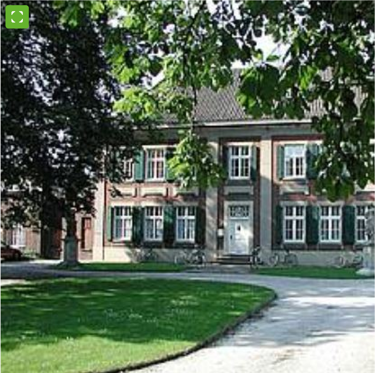
Woord Manor Bocholt

The Woord manor house was built between 1792 and 1795. The two-storey manor house is made of brick and ashlar with a hipped roof. It was extended in 1934. After the destruction of the war, the manor house was rebuilt in its old form and the outbuildings in a modified form.