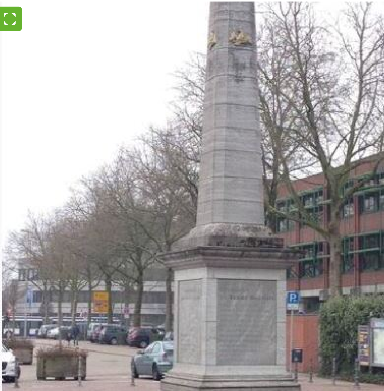
Obelisk on Berliner Platz in Bocholt

The obelisk in front of the town hall on Berliner Platz is a replica of a Prussian milestone on Berliner Platz, built in 1985. It is 470 km from its location to Berlin. For a long time, Berliner Platz was a "symbol of post-war urban development" and in this respect was characterised by sober reconstruction.